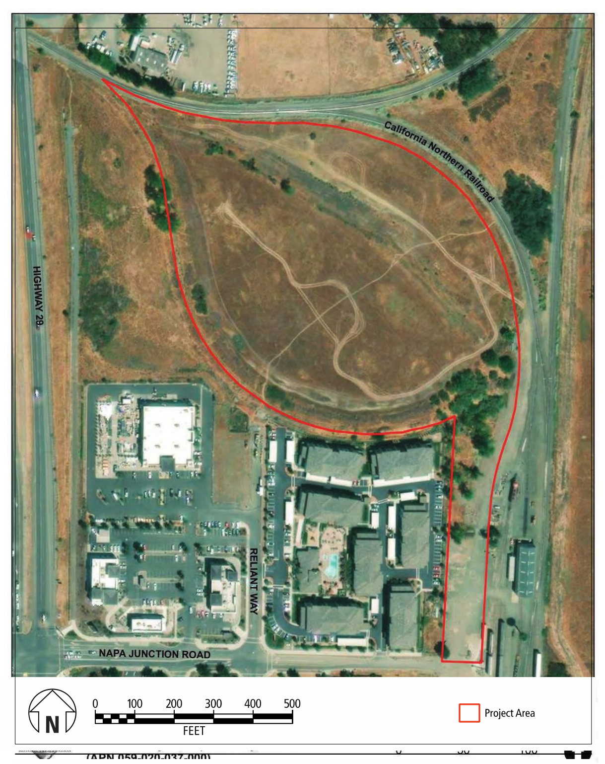
Figure 3 Project Site and Vicinity