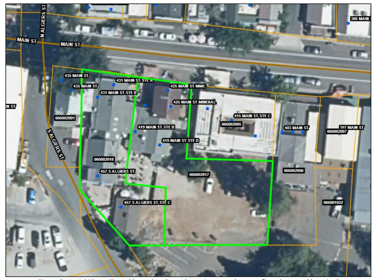
Figure 2- Aerial Photo (Parcel boundary lines shown in green do not reflect the actual location)