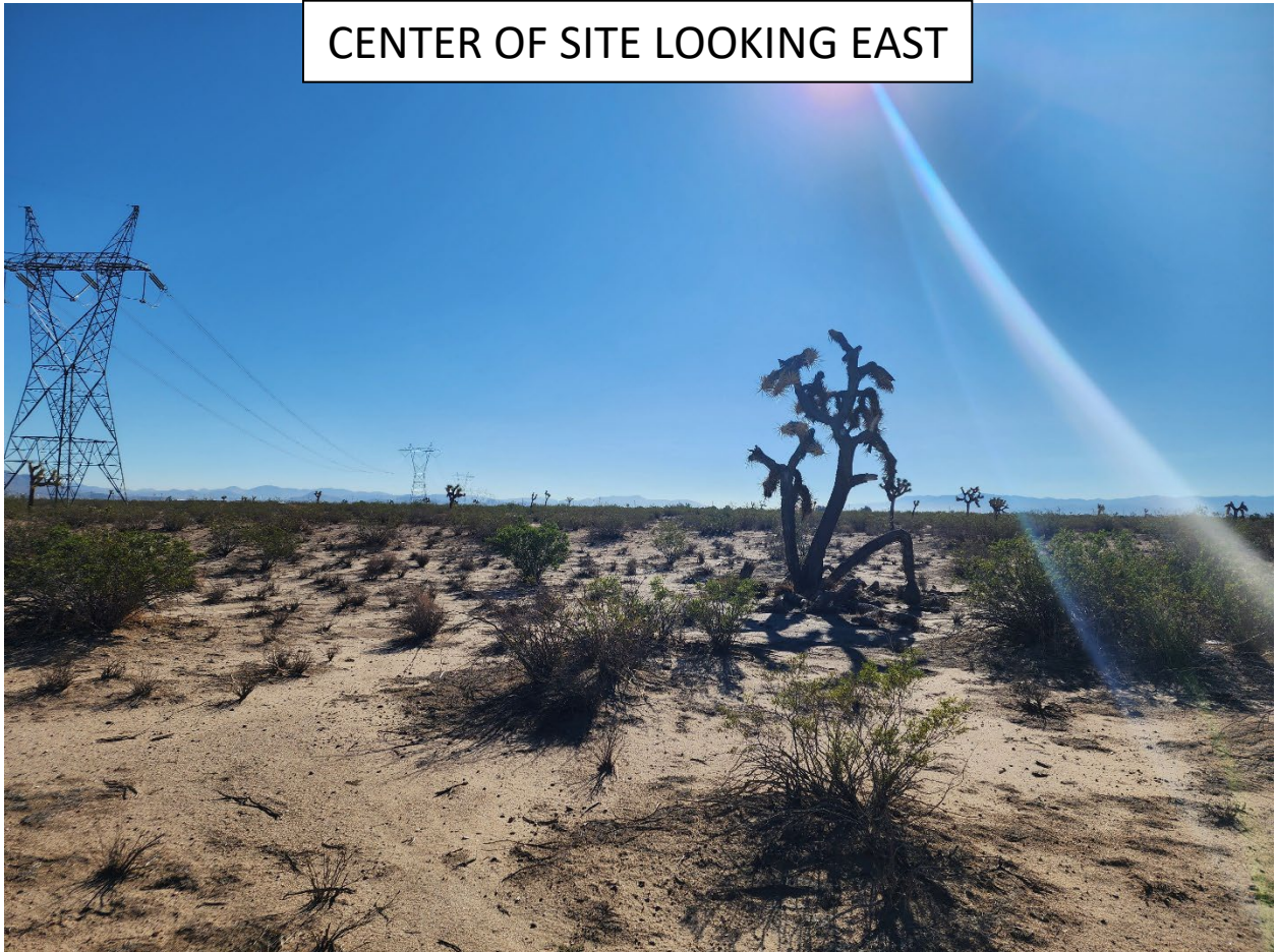
FIGURE 3: PHOTOGRAPHS OF SITE