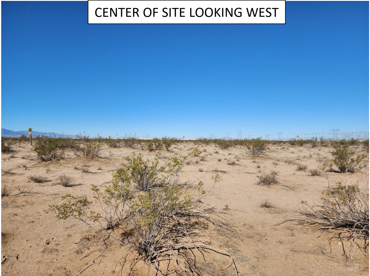
FIGURE 3, cont: PHOTOGRAPHS OF SITE