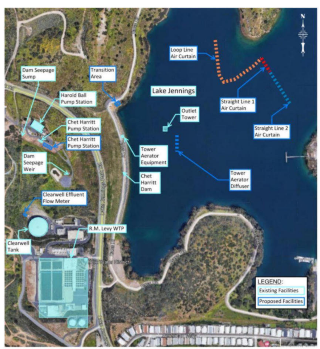
Figure 2. Project Location and District Facilities