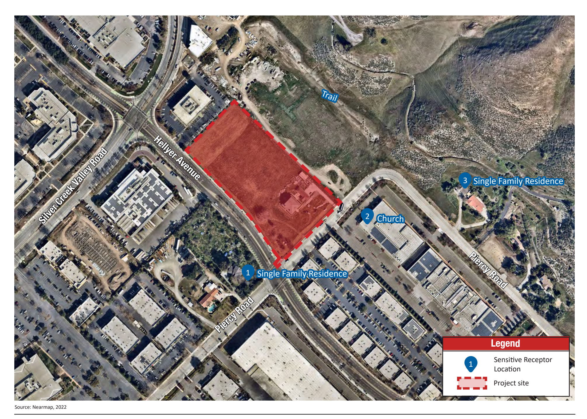
Figure 4: Sensitive Receptors