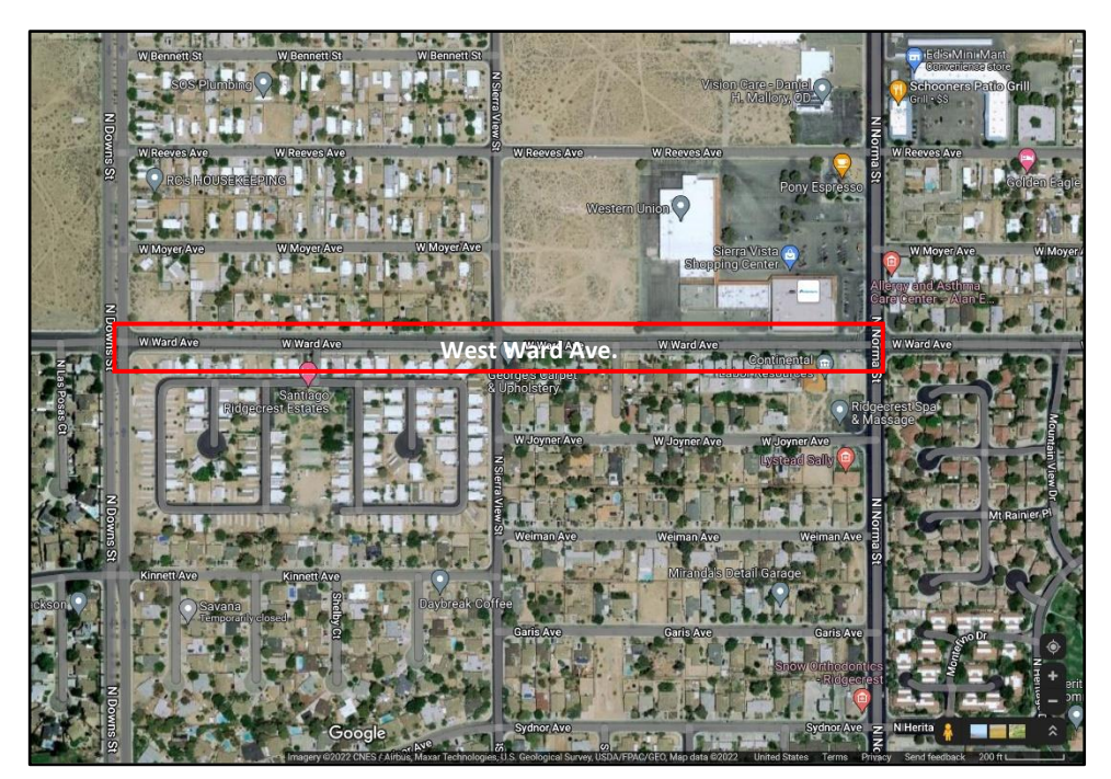
Figure 2 – Project Location