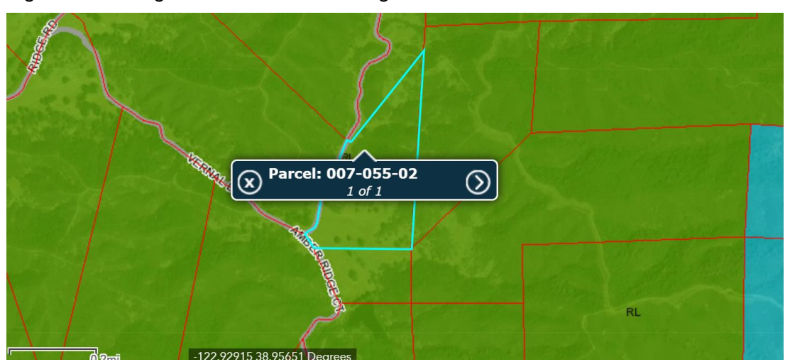
Figure 2 - Zoning of Site and Surrounding Area