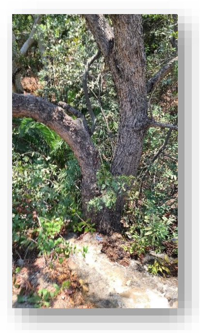
Plate 11. This is a view of a cement base that had been added atop the root crown of a tree following an erosional event due to a ruptured water pipe beneath the street (#NT6).