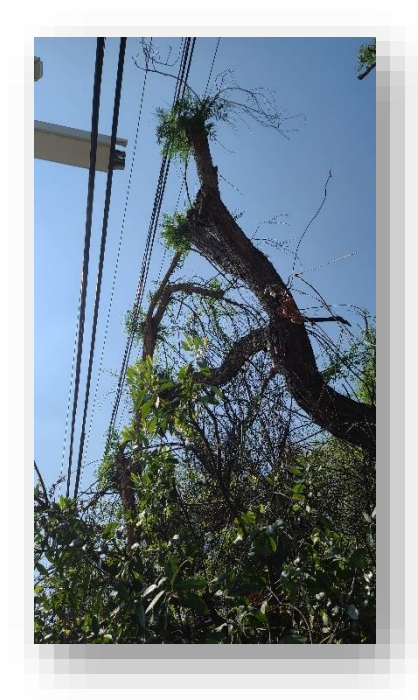
Plate 17. This is a view of a topped tree that has resulted in water sprouting (#NT18).