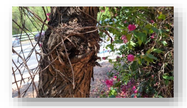
Plate 13. This is a view of a decayed wood within an unclosed branch cut (#629).