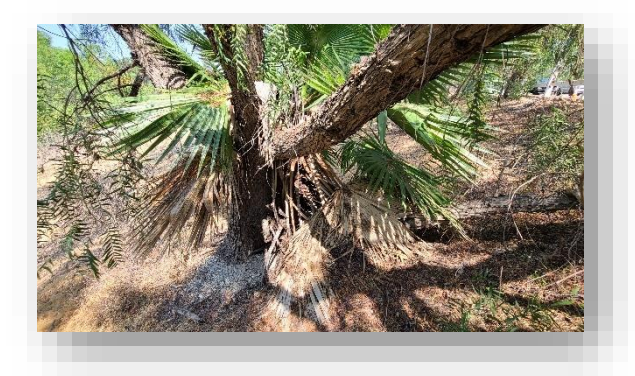
Plate 15. This is a view of a palm growing beneath the canopy of a tree (#643).