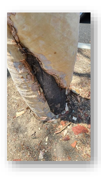
Plate 6. This is a view of decay noted within the lower stem and flare of a tree compromising structural integrity (#620).