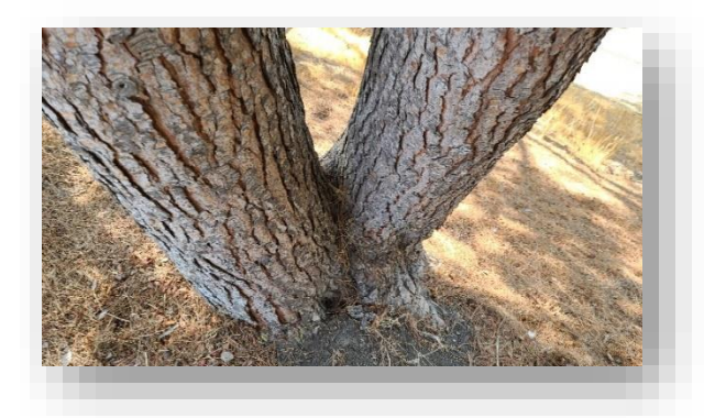
Plate 1. This a view of a co-dominant stem with poor crotch strength (#605).