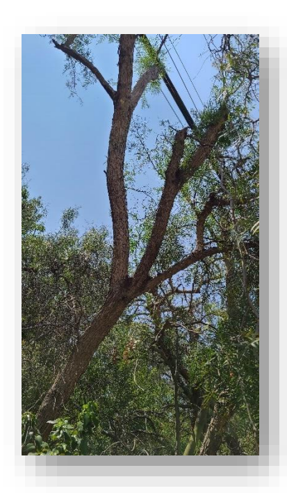
Plate 12. This is a view of utilities running close to branches and foliage within the crown of a tree (#NT10).