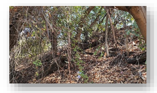
Plate 4. This is a view of a fallen stem that continues to sprout (#617).