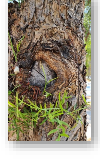
Plate 2. This is a view of internal deadwood within an unclosed branch cut (#611).