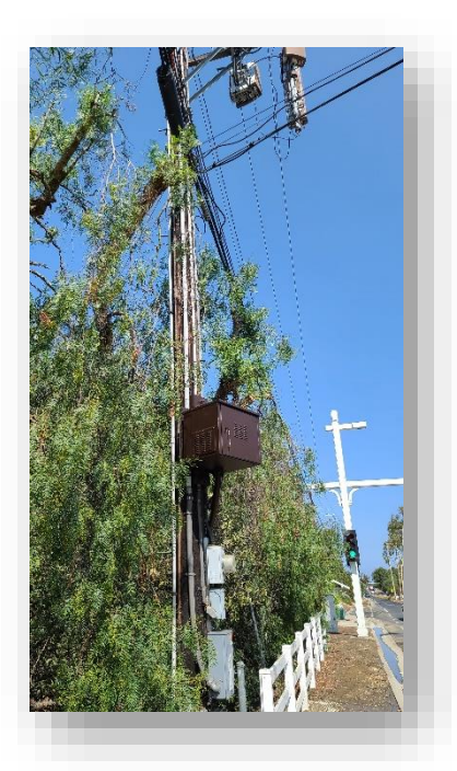
Plate 18. This is a view of a tree canopy currently contacting utilities posing a potentially hazardous condition (#NT22).