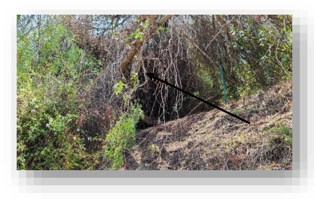
Plate 8. This is a view of a poorly devoped canopy an stem of a tree (#NT3).