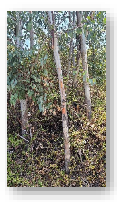
Plate 3. This is a view of a dense tree stand with competing canopies (#615).