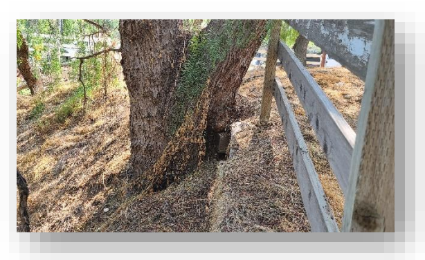
Plate 16. This is a view of a compromised flare of a tree due to an adjacent walkway (#651).