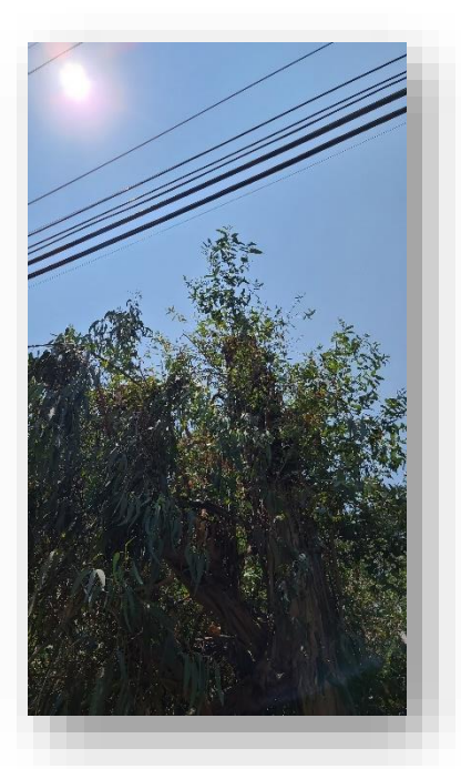
Plate 7. This is a view of a topped tree trimmed to allow for overhead wires, but contributing to water sprouting (#624).