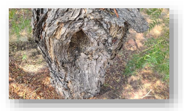
Plate 14. This is a view of a large cavity within the stem of a tree (#639).