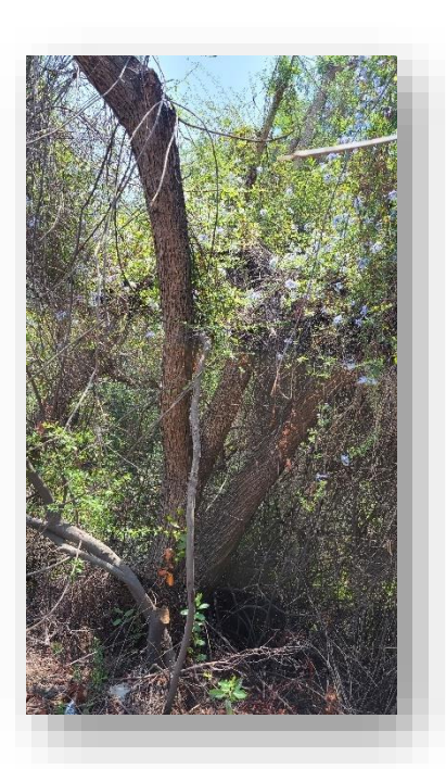
Plate 10. This is a view of a poorly developed canopy (#NT6).