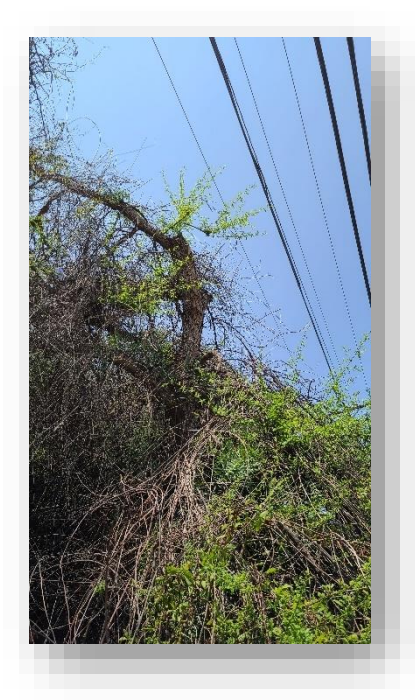
Plate 9. This is a view of a tree that has been severely trimmed to allow for overhead utilities (#NT4).