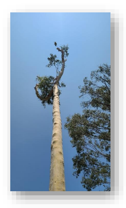
Plate 5. This is a view of a poorly trimmed tree in which limbs were topped and excess canopy had been removed (#618).