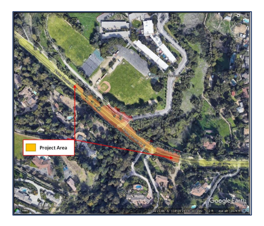
Figure 2- Project Location and Limits of Construction