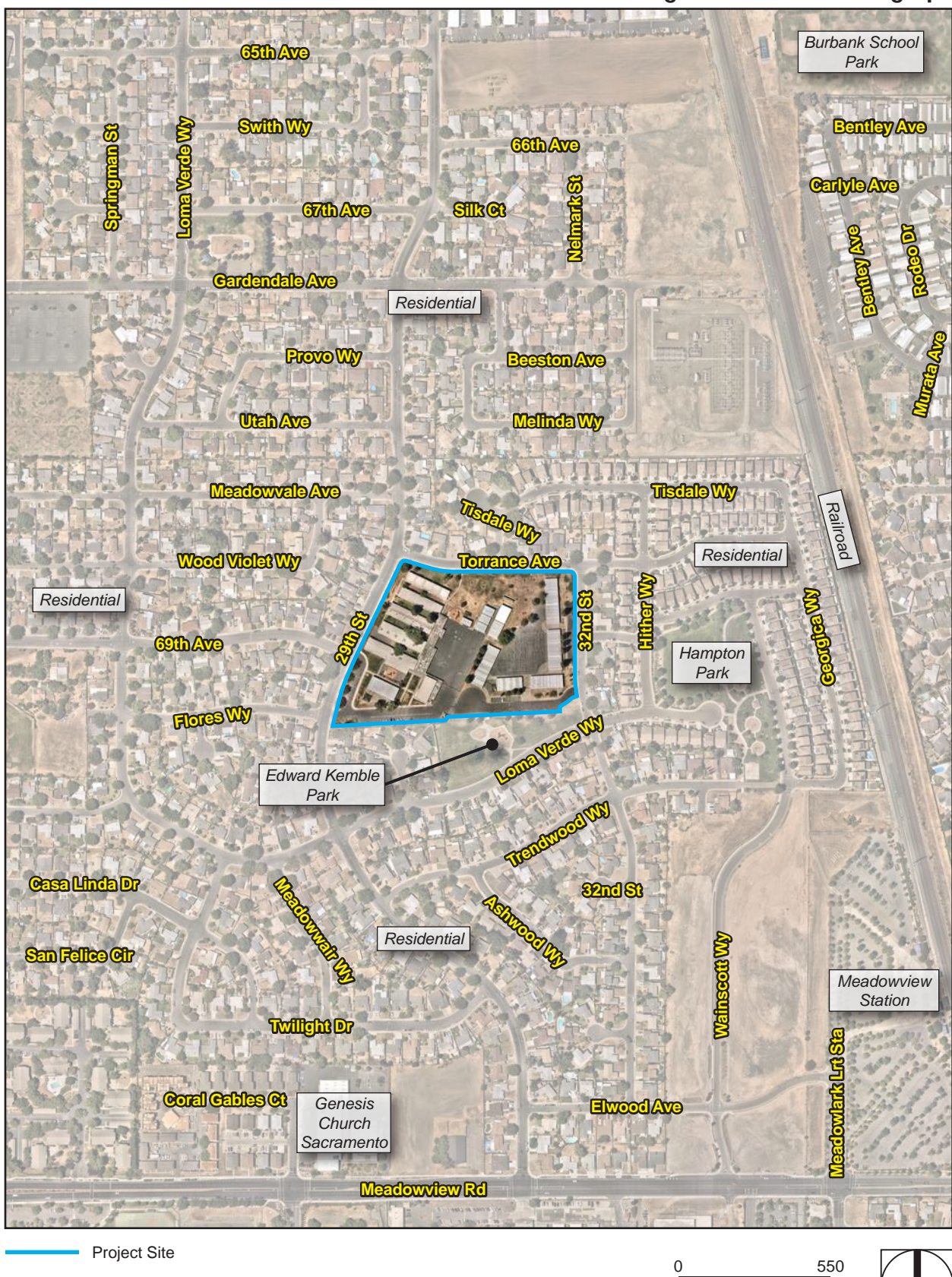
Figure 3 - Aerial Photograph