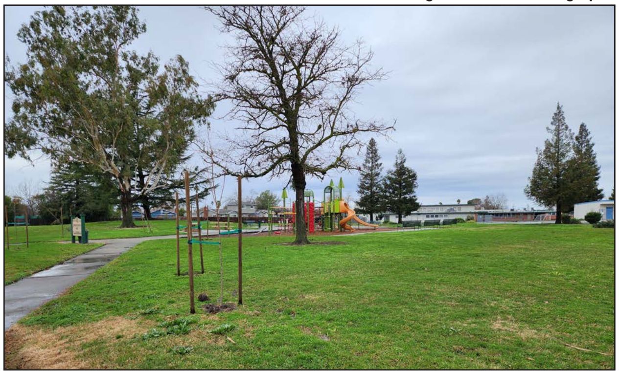
Figure 4a - Site Photographs