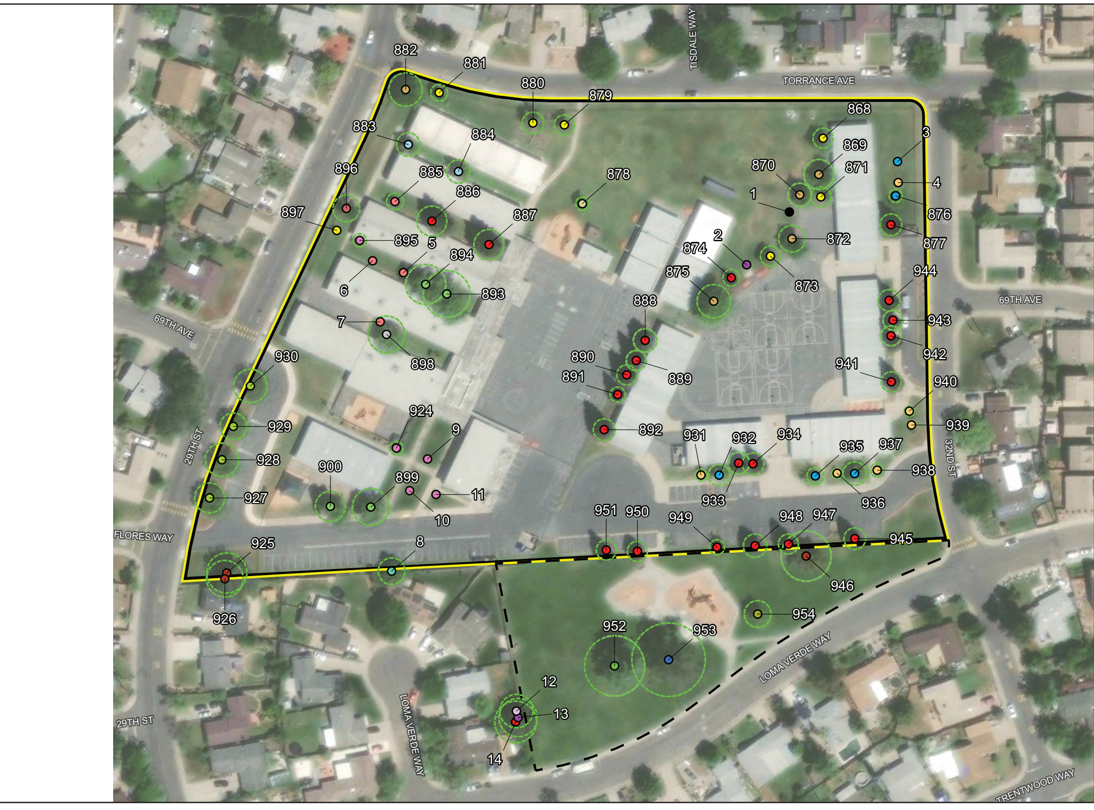
Figure 6 - Arborist Survey Results