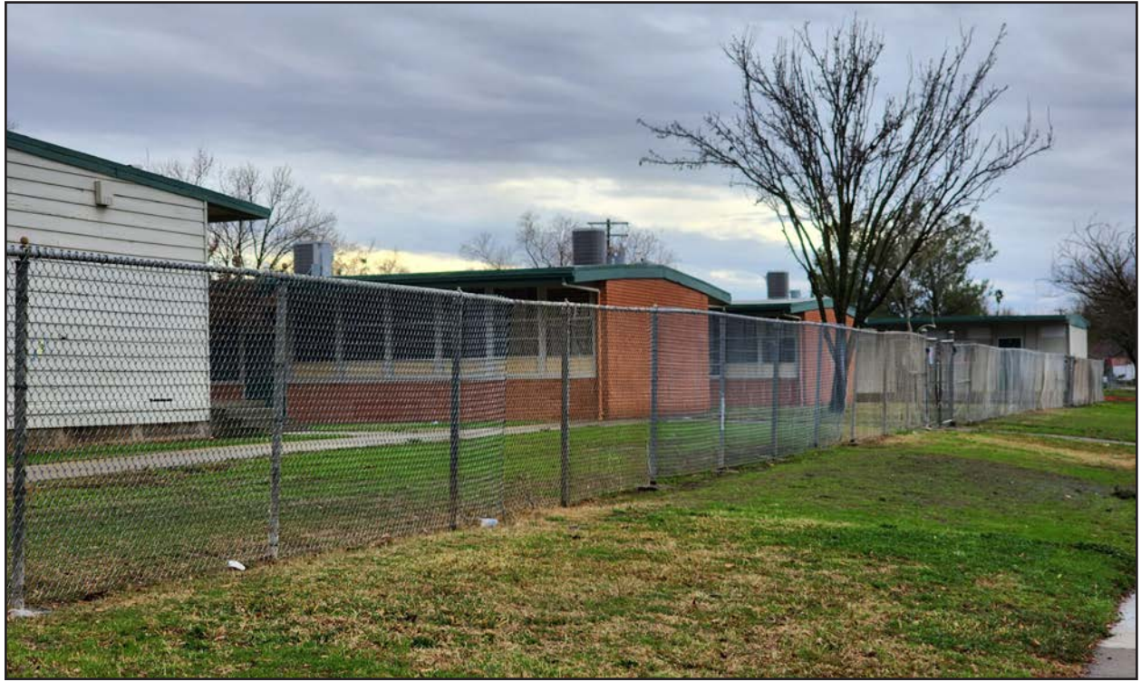
View of Edward Kemble Elementary School.