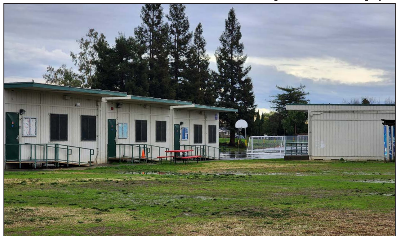
View of Edward Kemble Elementary School.