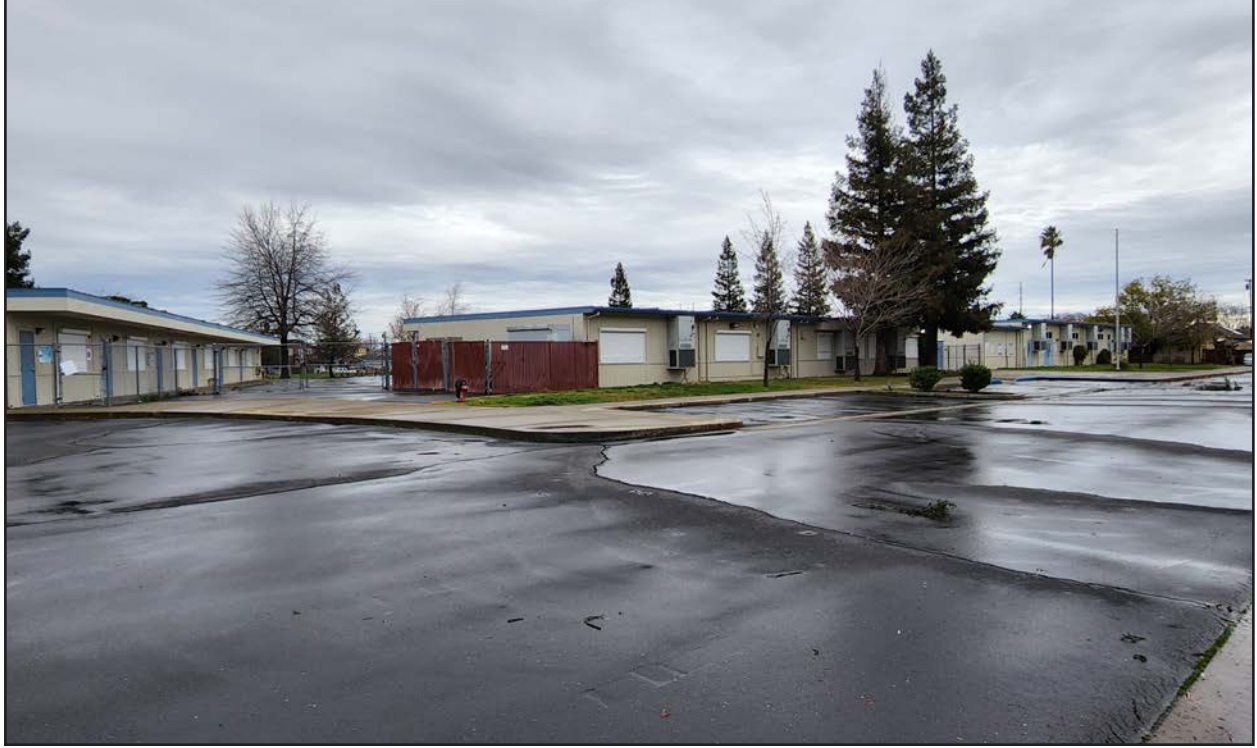
View of Cesar Chavez Elementary School.