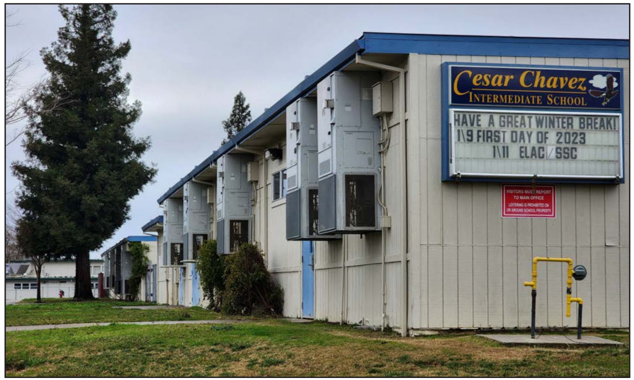
View of Cesar Chavez Elementary School.