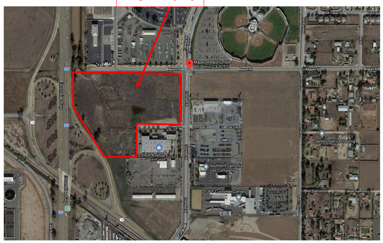
FIGURE 1. SITE LAYOUT MAP