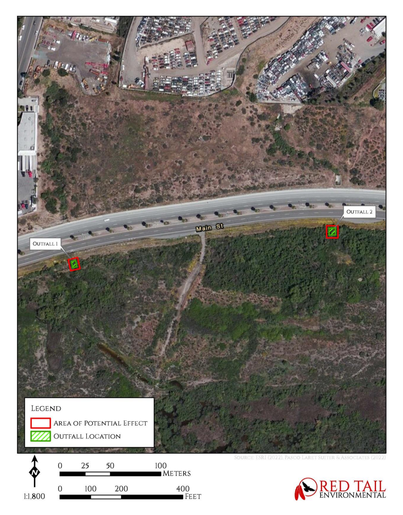
Figure 3. Area of Potential Effects Map.

April 22, 2022 Nirvana Industrial Project Outfalls Archaeological Resource Survey Report Page 5 of 43