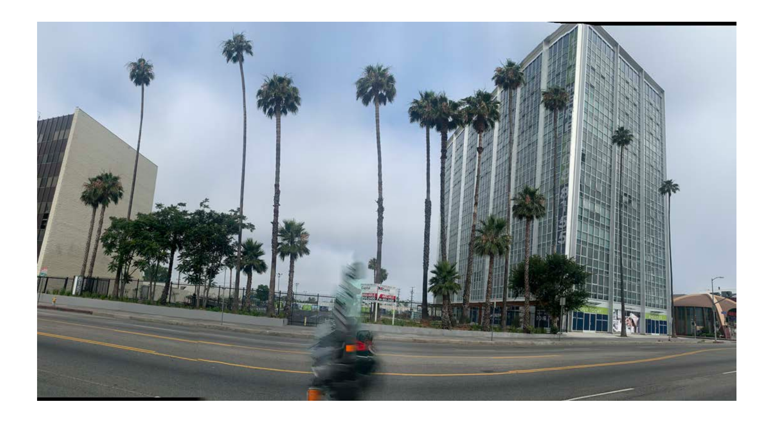
PHOTO 1 - Shows some of the non-protected significant trees on site. These trees will be removed.