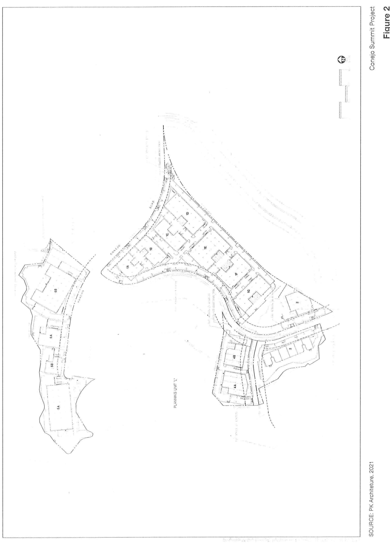
Figure 2 Site Plan