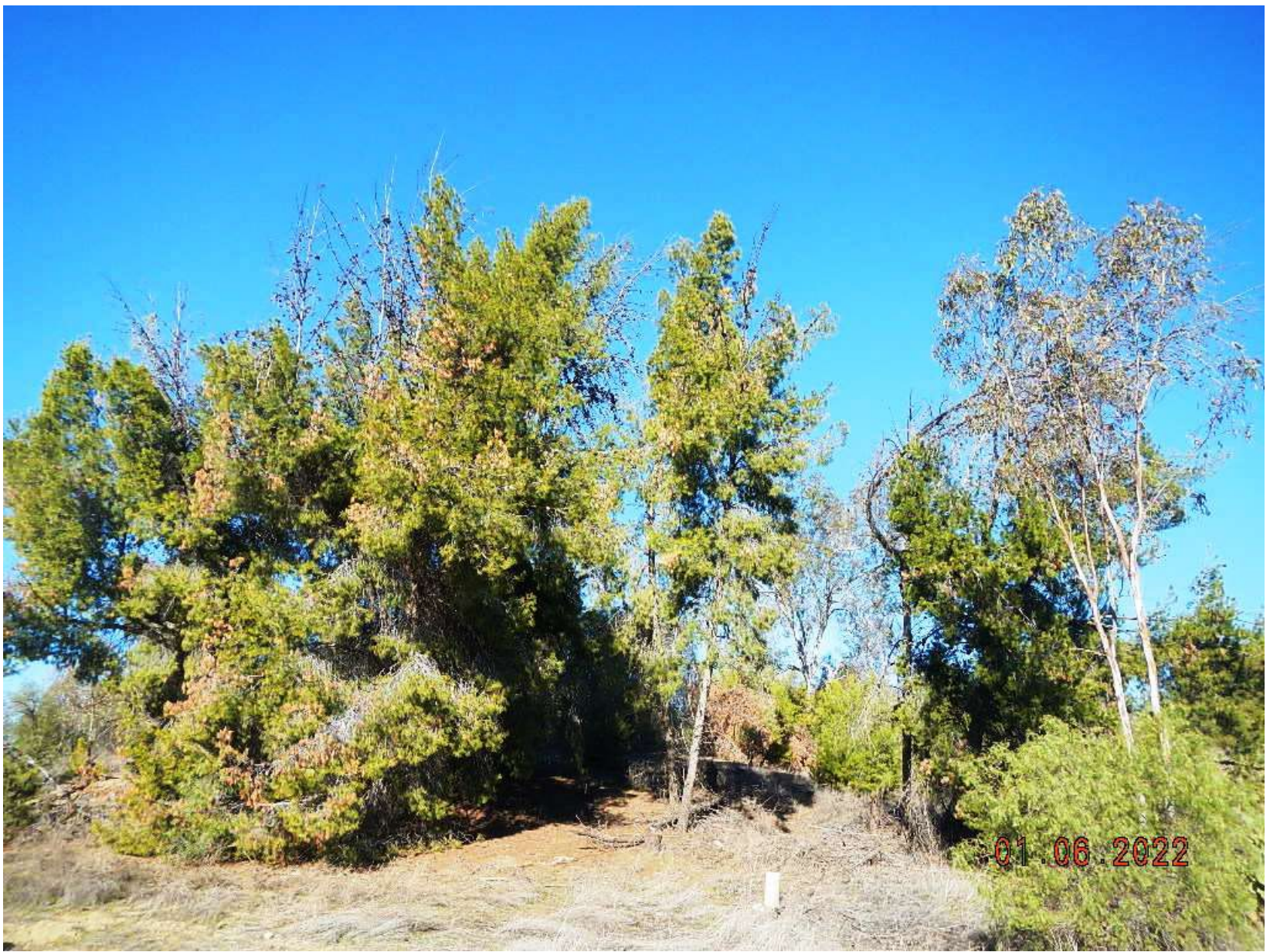
Aleppo pines in severe drought stress. Note dieback and chlorotic foliage.