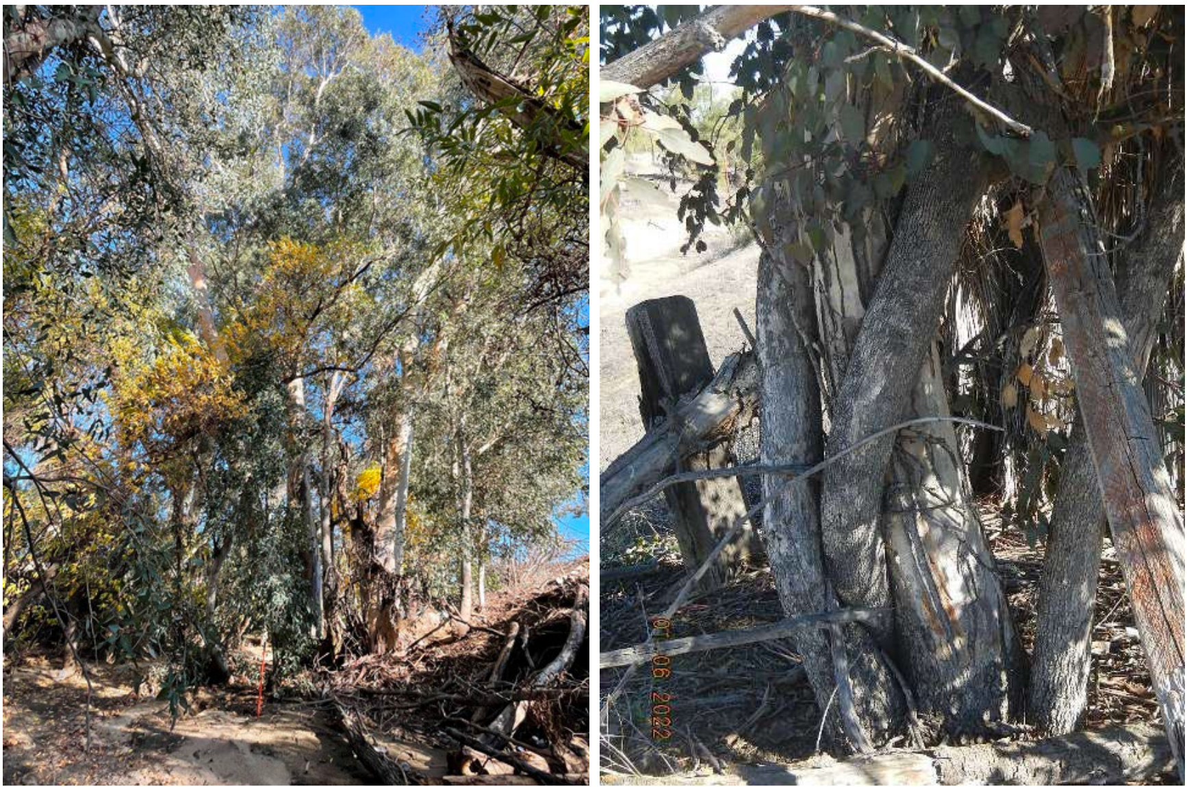
Looking north in about the middle of the outflow area.