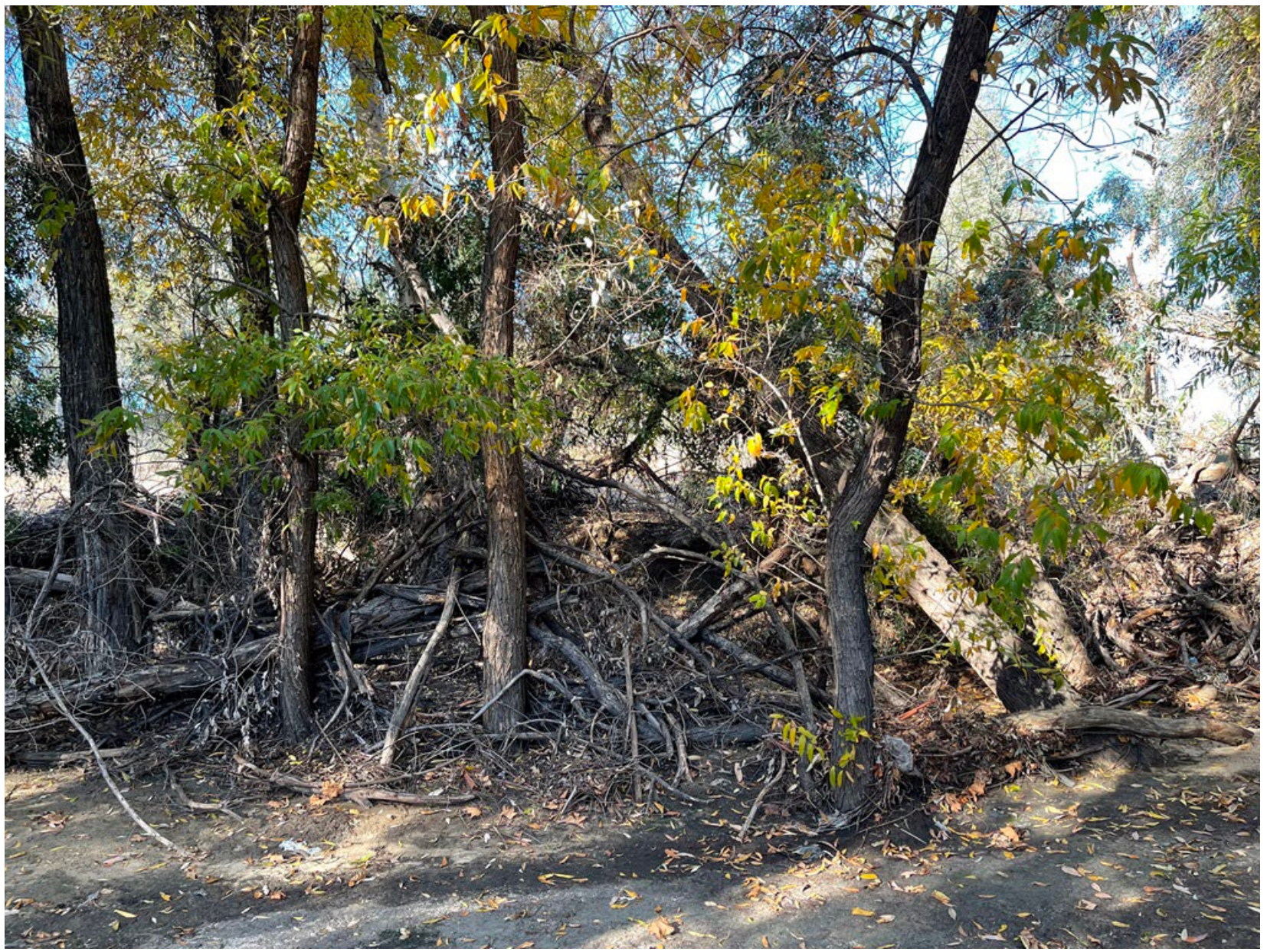
There are five Arroyo willows in this one group, and parts of others