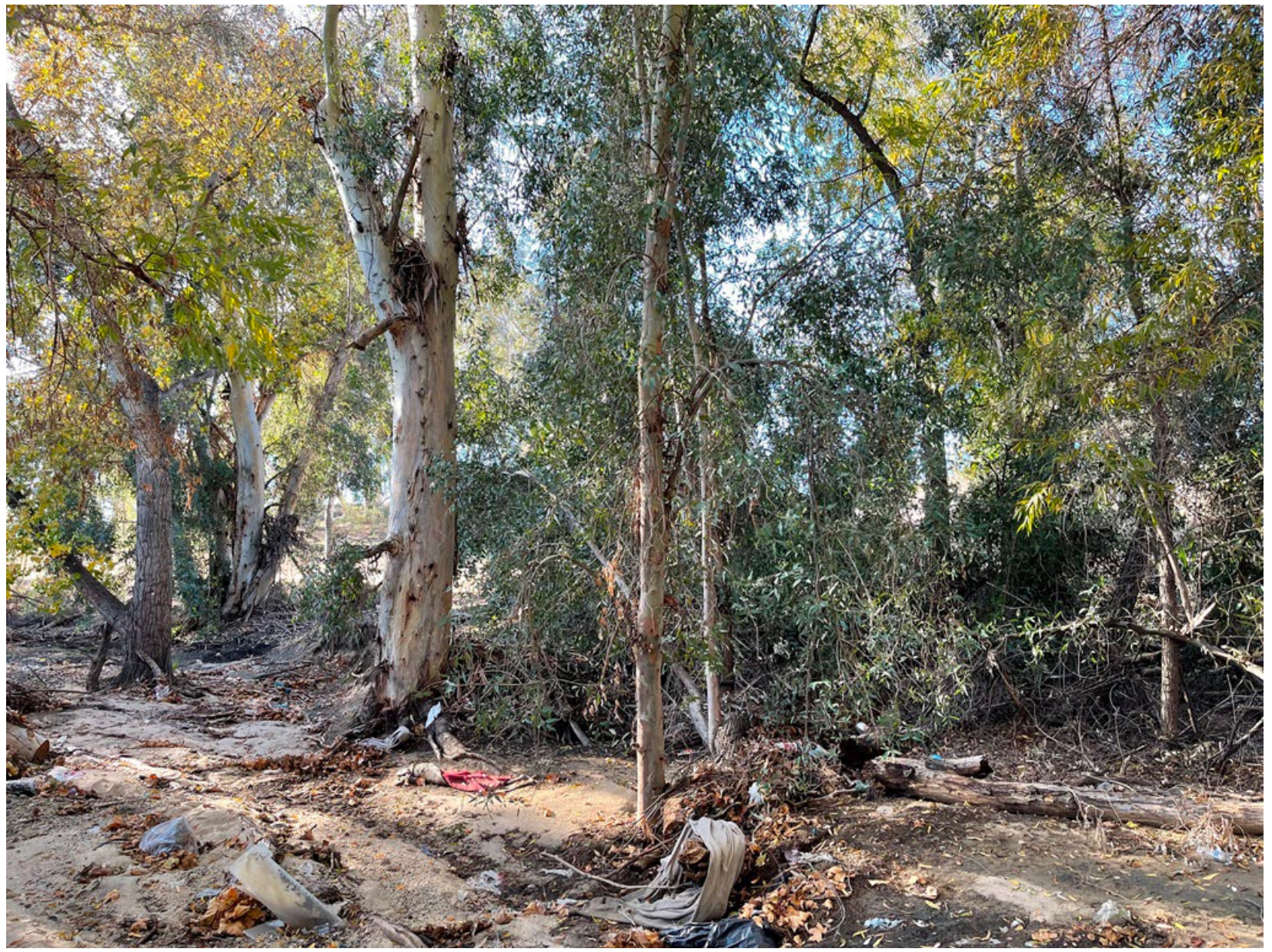
Note the debris in the watercourse.