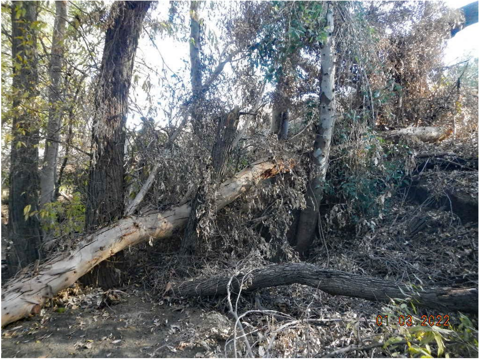
This red gum fell through another group of willow and broke one.