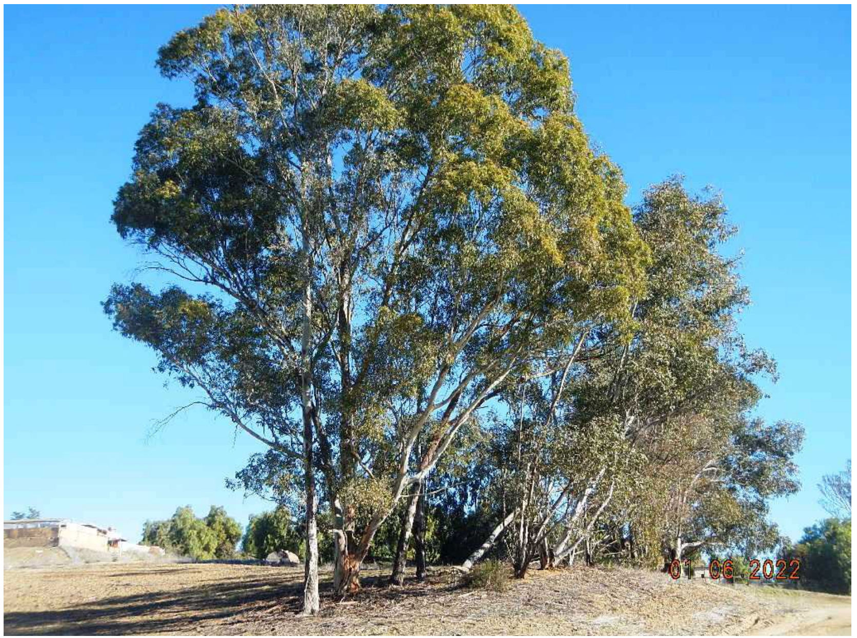
Row of redgums behind the first house at the north corner of the site.