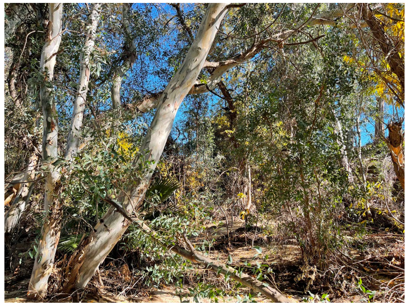
Note jumble of trees, leaning trees, fallen limbs and seedlings in the outflow area