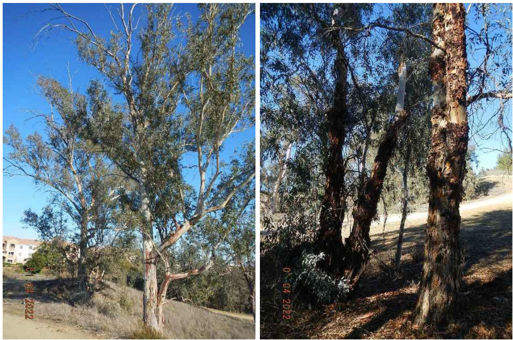
Note dieback, sparse foliage and epicormic shoots near #137