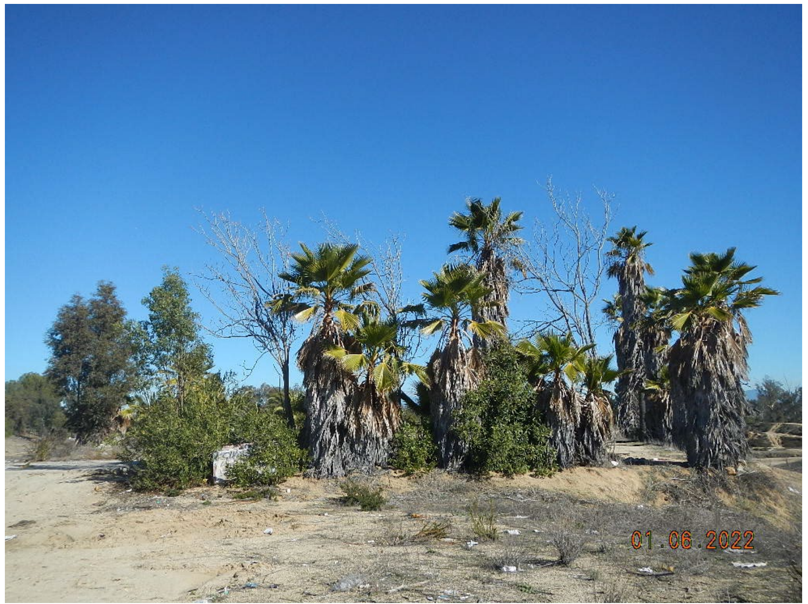
Mexican fan palms are not drought tolerant. These are declining as indicated by the small heads and limited number of fronds.