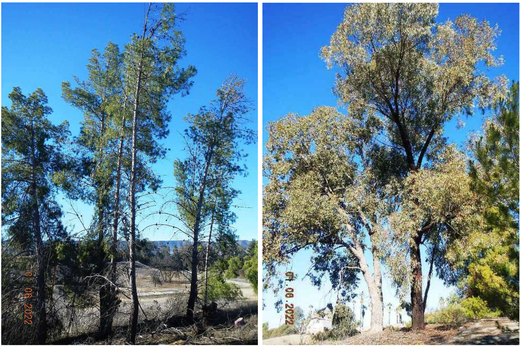
Row of Aleppos behind the first house at the north corner of the site.