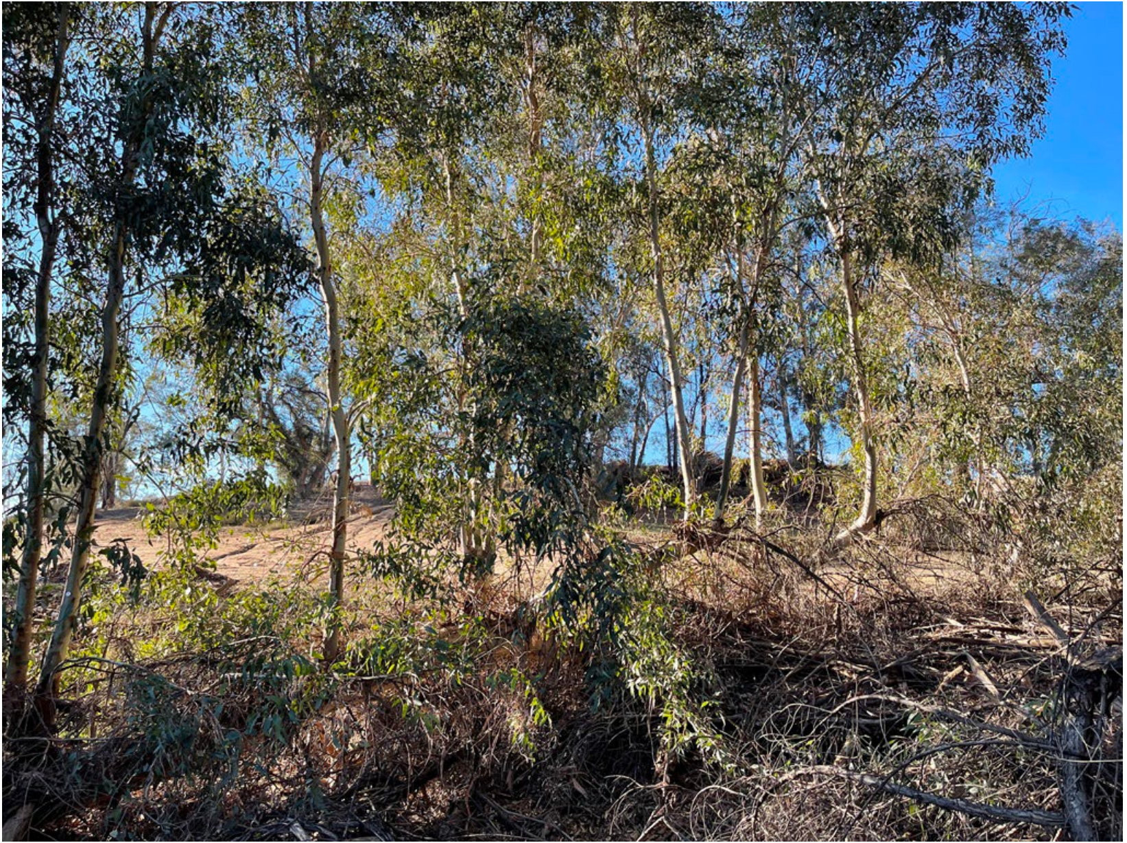
The edge of the outflow area, with the parallel group of redgums behind.