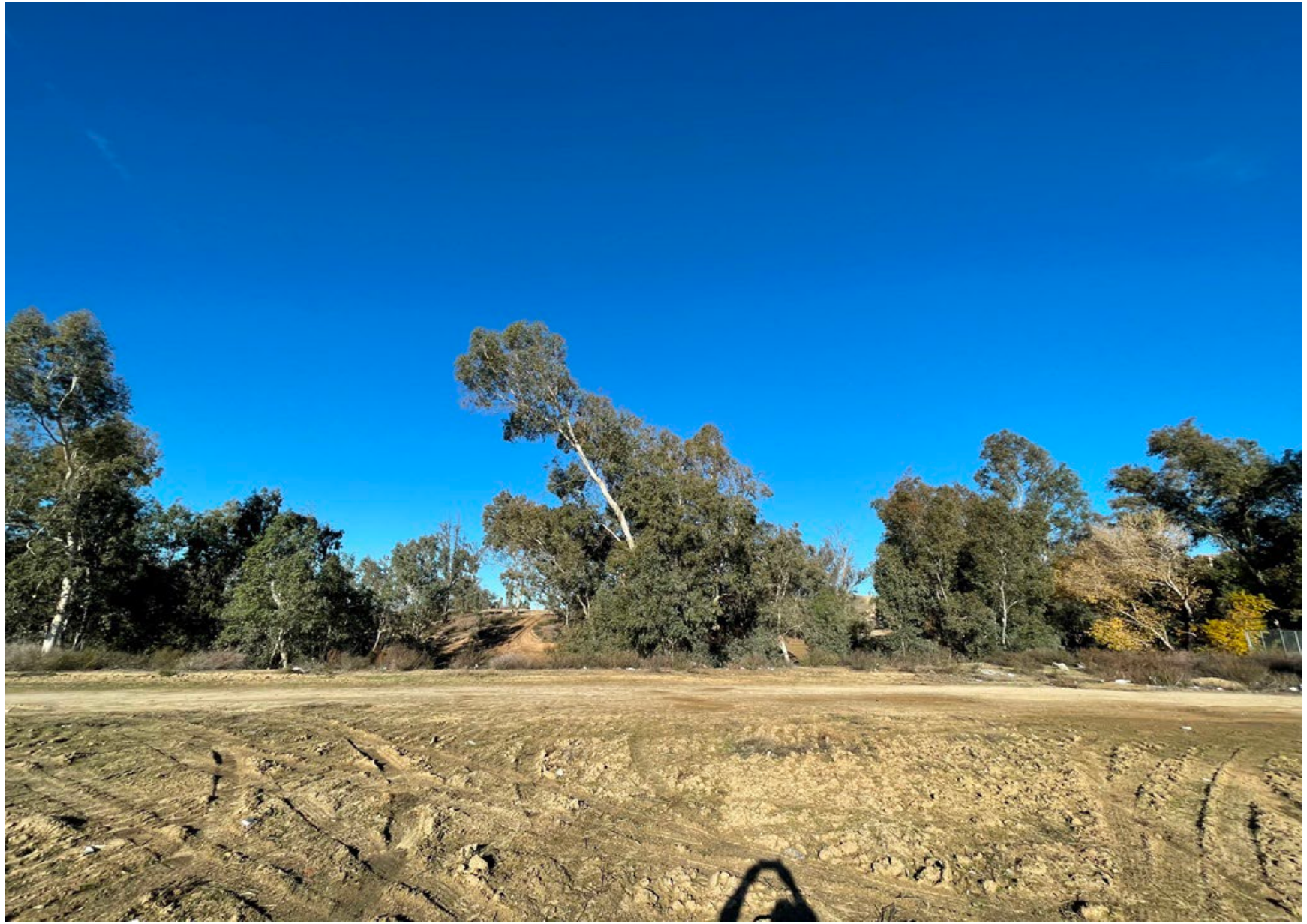
The south part of the outflow area, looking northwest from the corner.