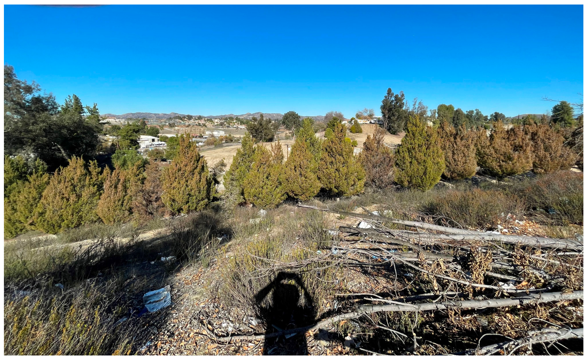
Far west end of Vista Murrieta, viewed from above, note browning.