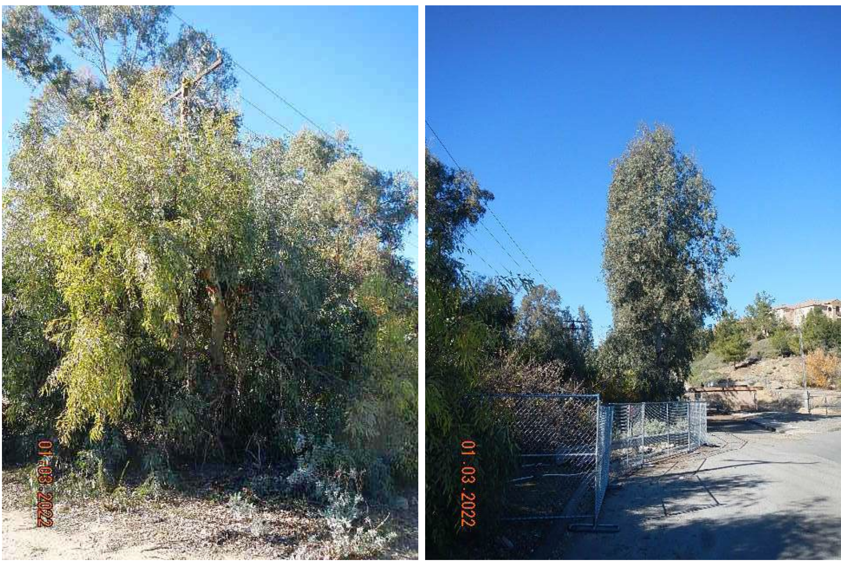
Tree #1 is topped for wires