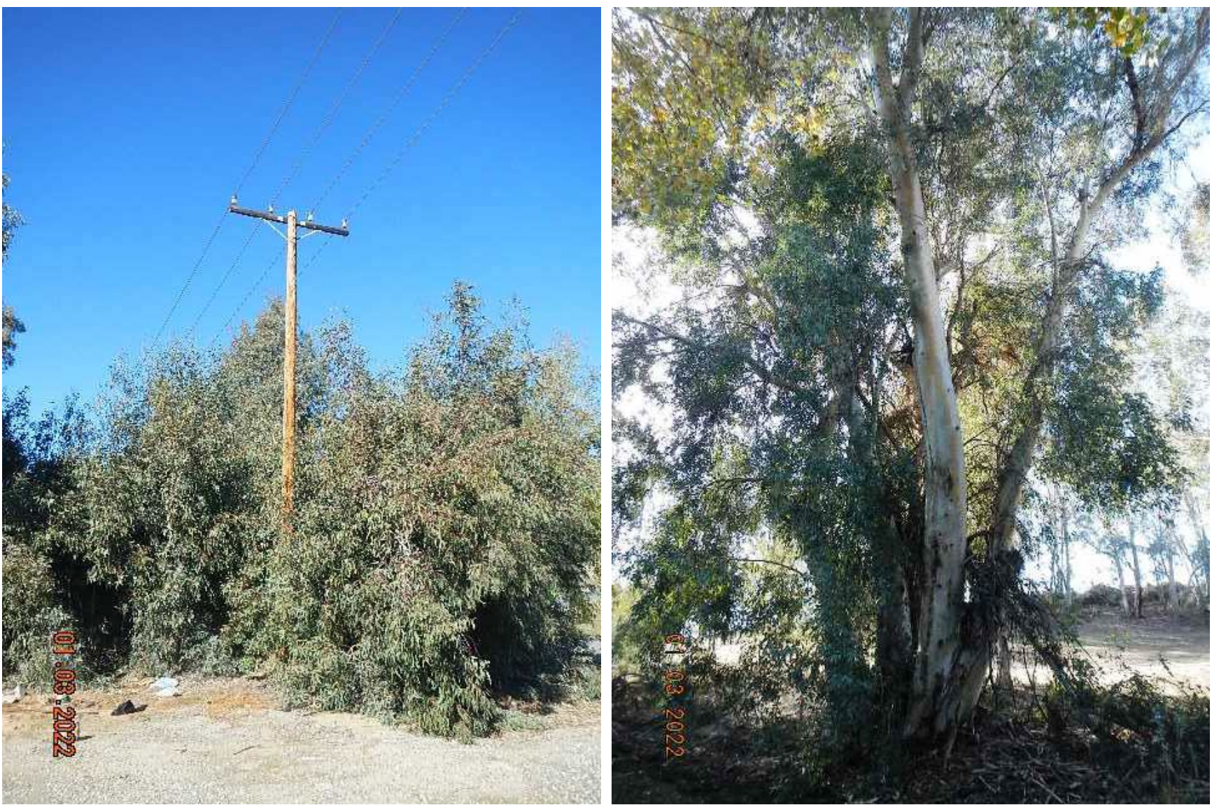
Overhead wires necessitated the topping of many trees in the arroyo.

Many of the redgums have crowded trunks pressing against each other.