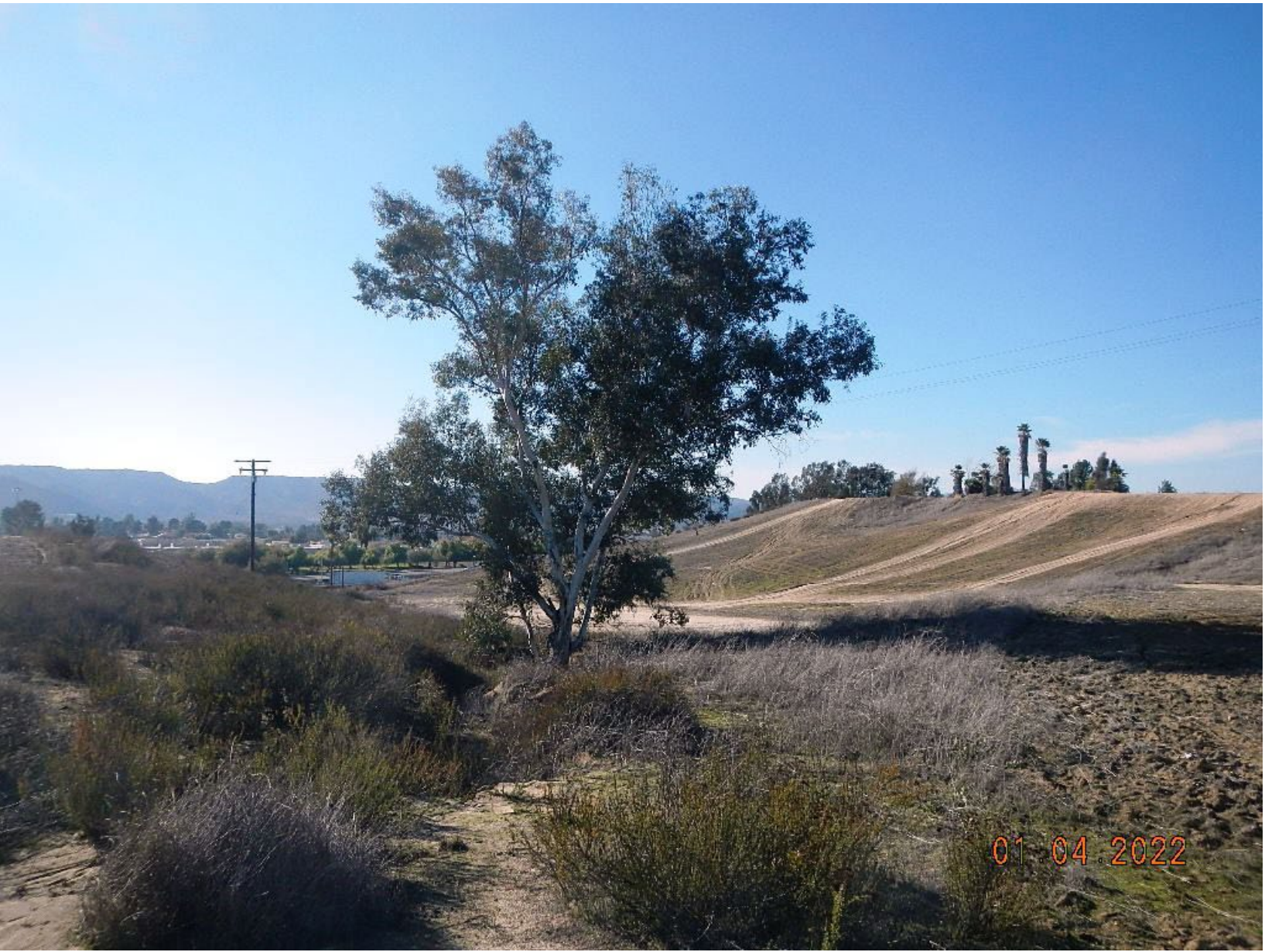
#173 in a ravine in the central part of the site.