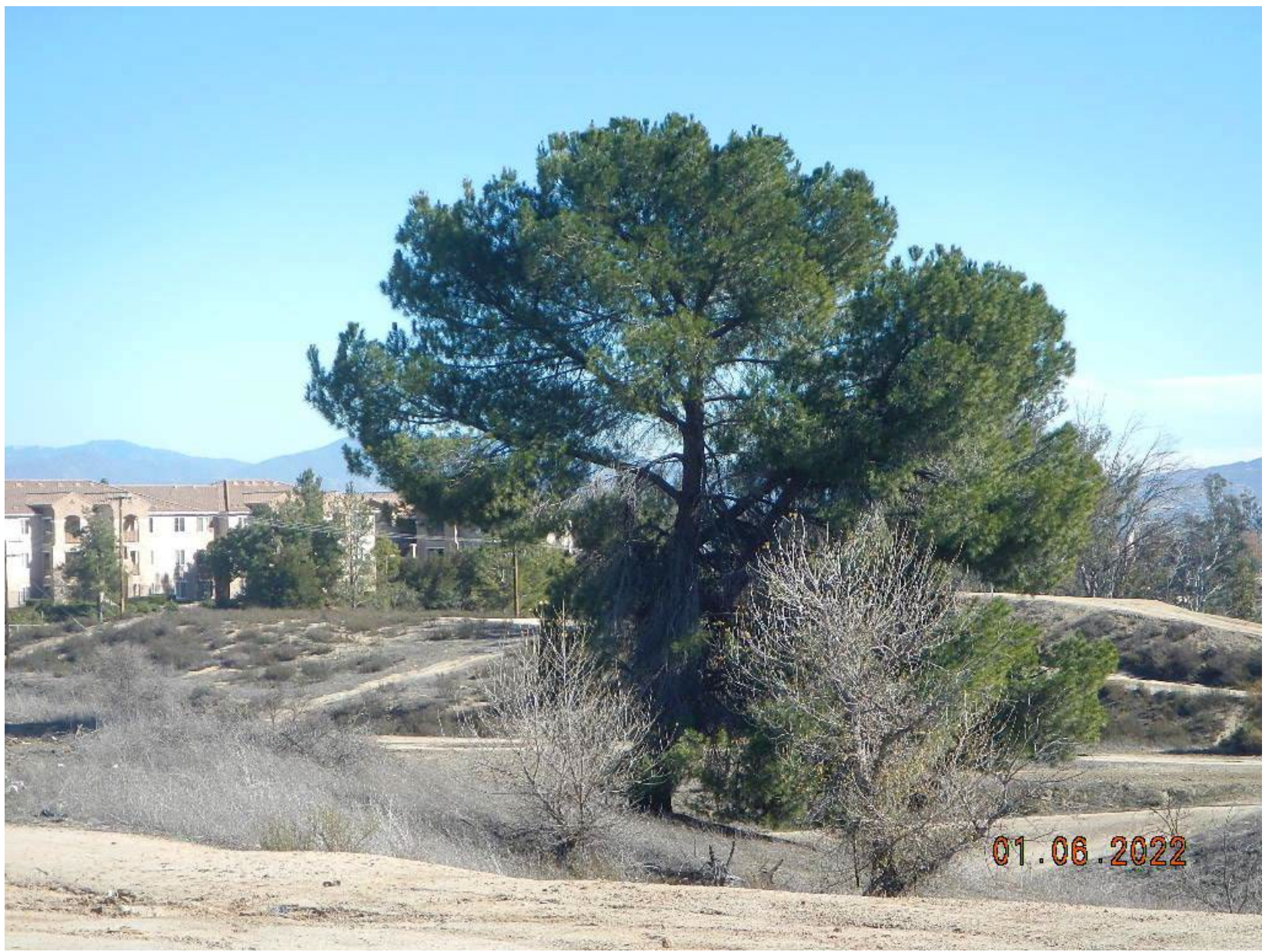
#197 Aleppo pine in a ravine in the central part of the site.