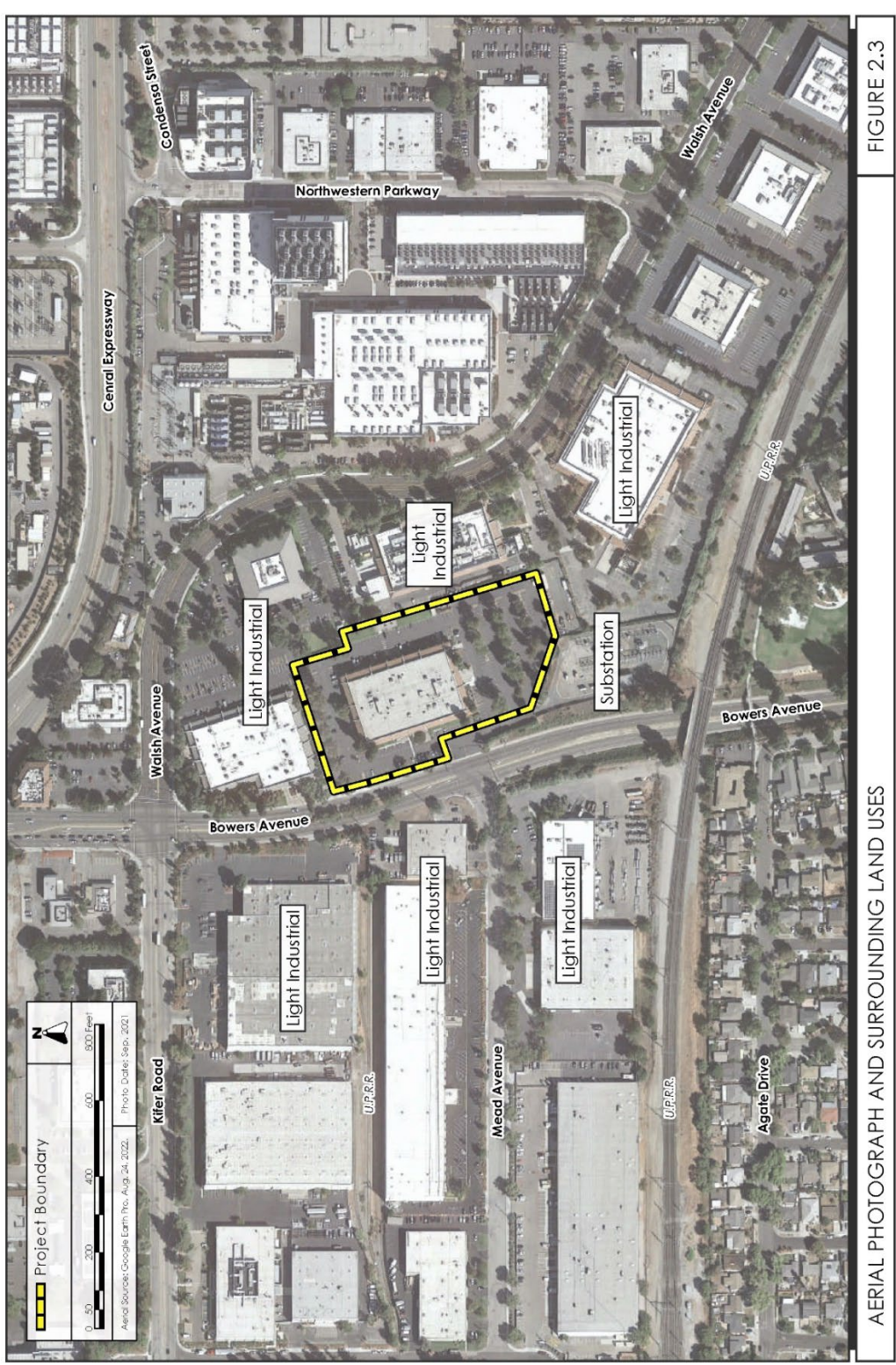
Aerial Photograph and Surrounding Land Uses (Figure 2.3)