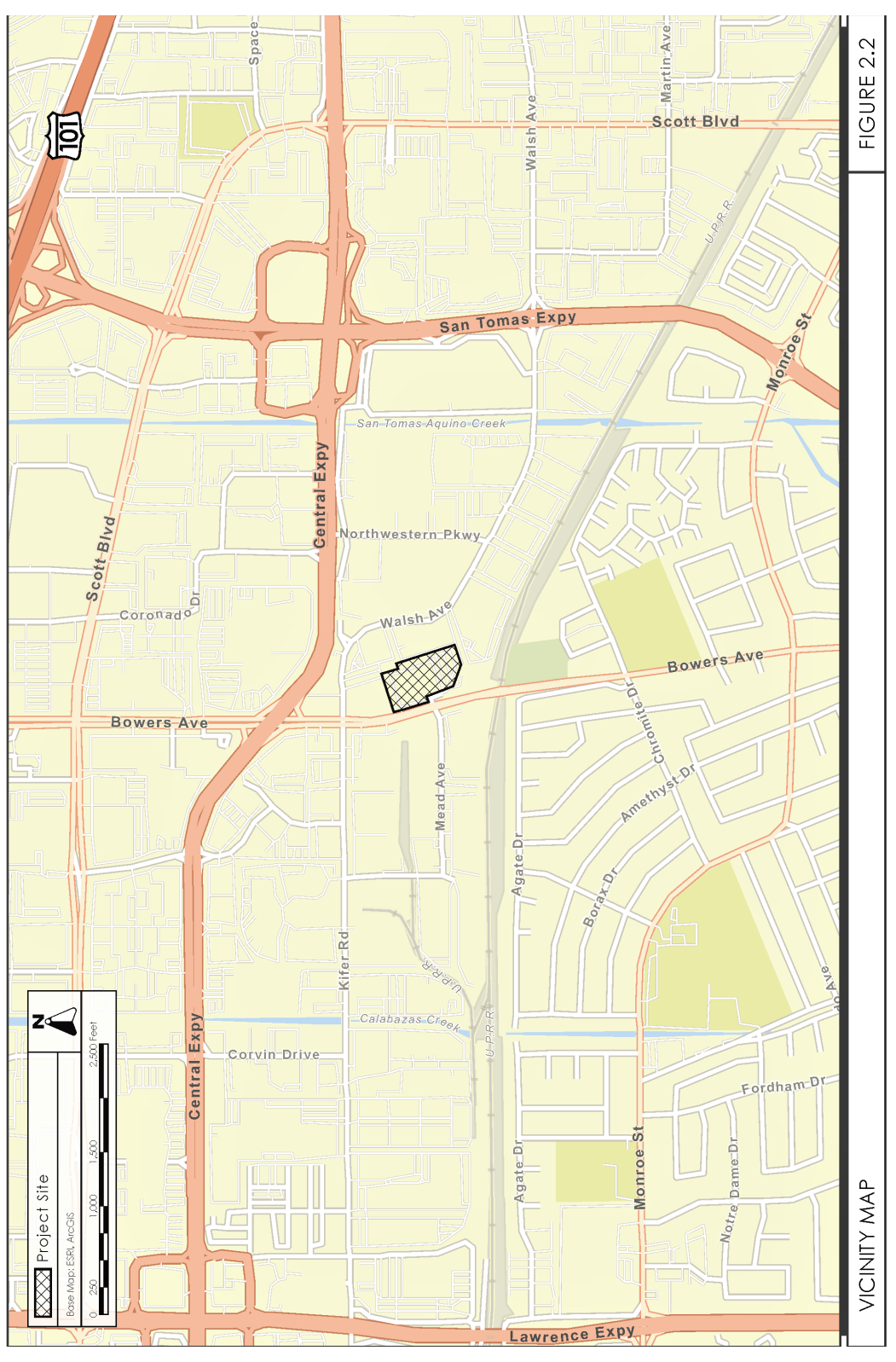
Vicinity Map (Figure 2.2)