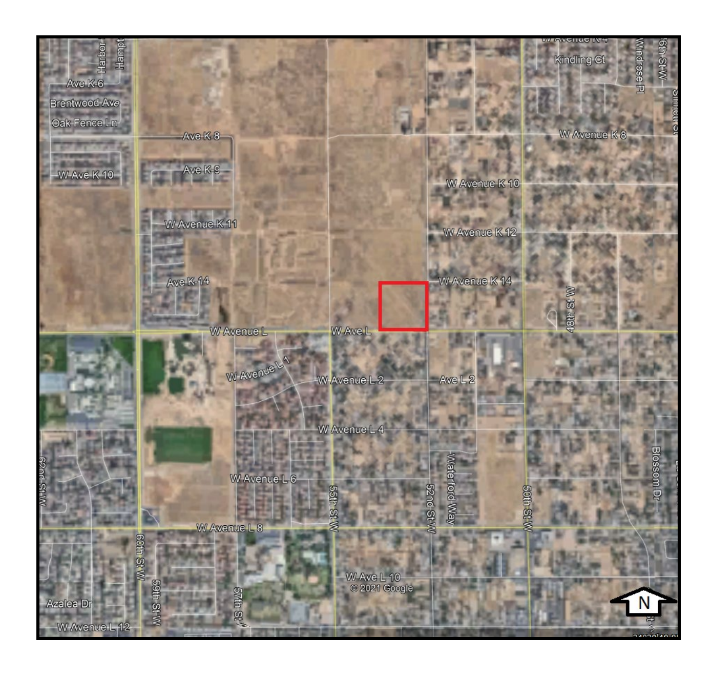
Figure 3. Approximate location of study area as depicted on excerpt from Google Earth Aerial Photography, dated July 2017, showing surrounding land use.