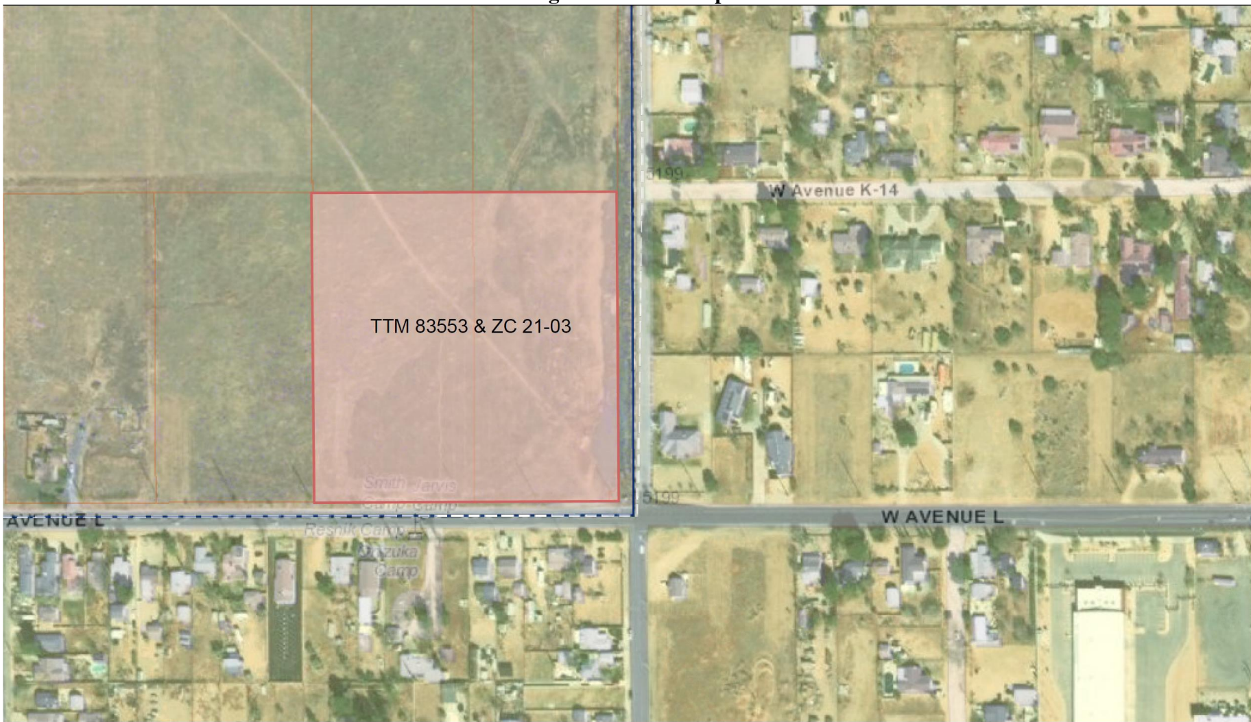
Figure 1: Aerial Map