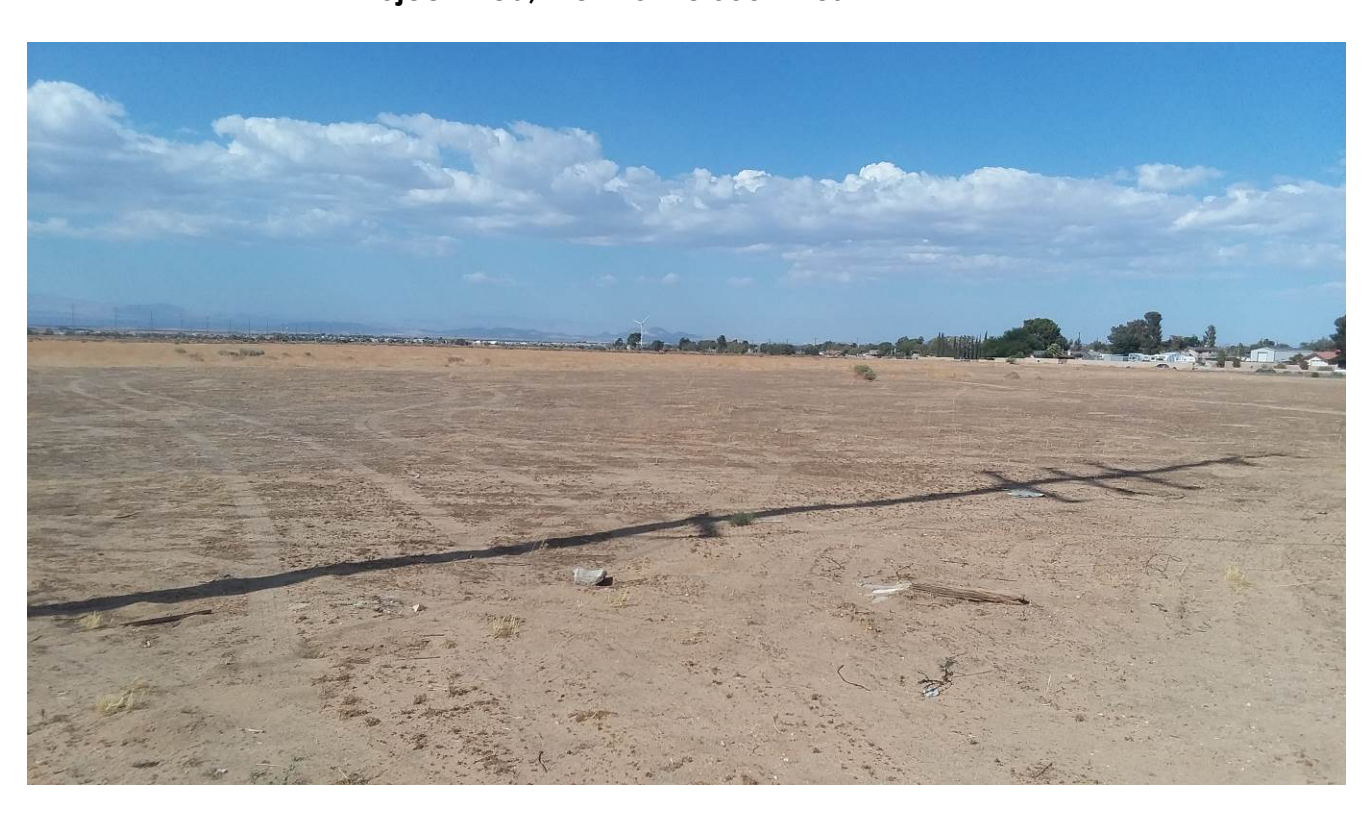
Figure 3 Project Area, View to the Northeast