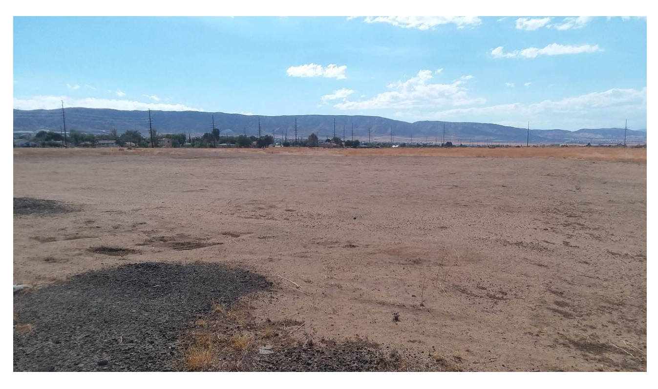
Figure 2 Project Area, View to the Southwest