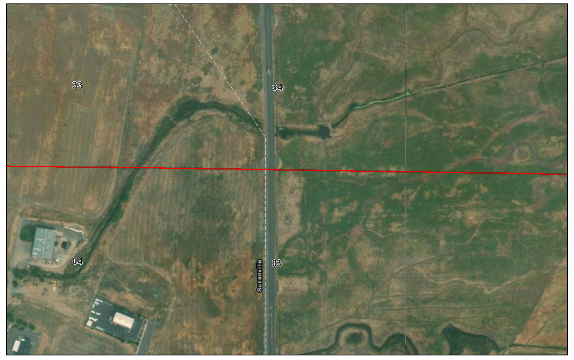
December 6, 2022