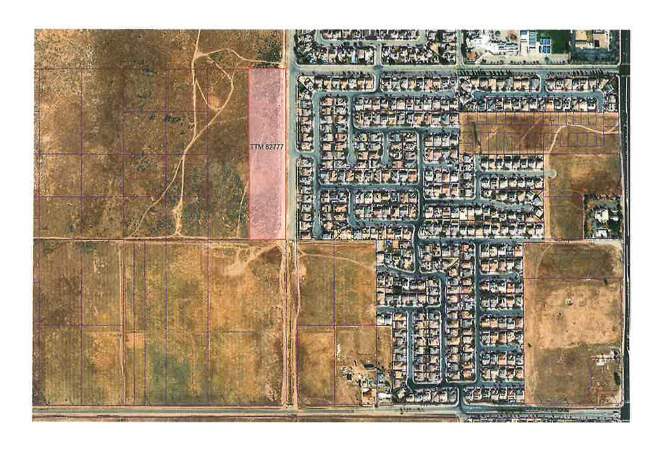
Figure 1, Project Location Map