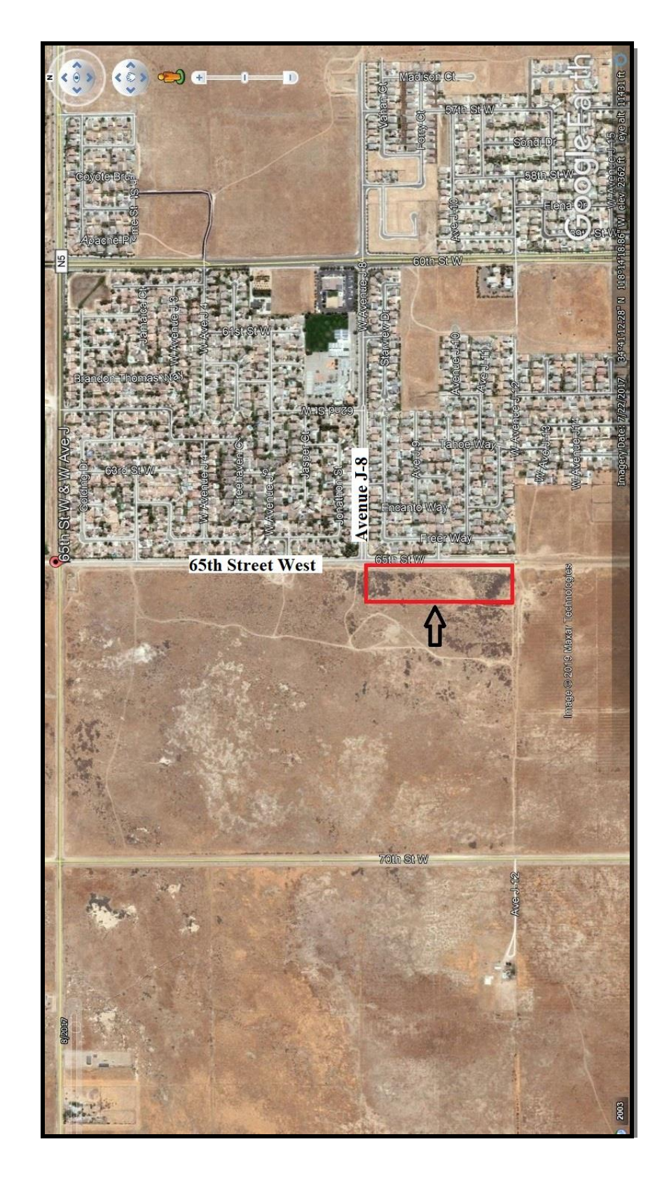
Figure 3. Approximate location of study area as depicted on excerpt from Google Earth Aerial Photography, dated July 2017, showing surrounding land use.