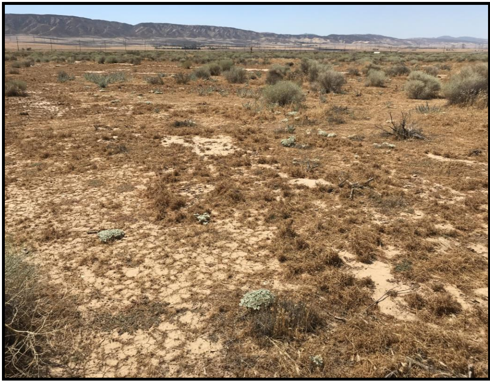
Figure 4. Representative view of Great Basin sage area in south portion of site (top), rabbit brush/burn area in center of site (bottom).