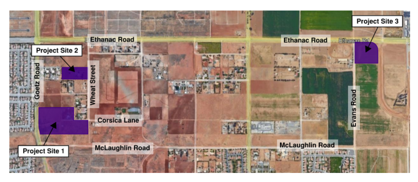
Figure 2 Project Site 1 (Corsica Lane) Conceptual Plan