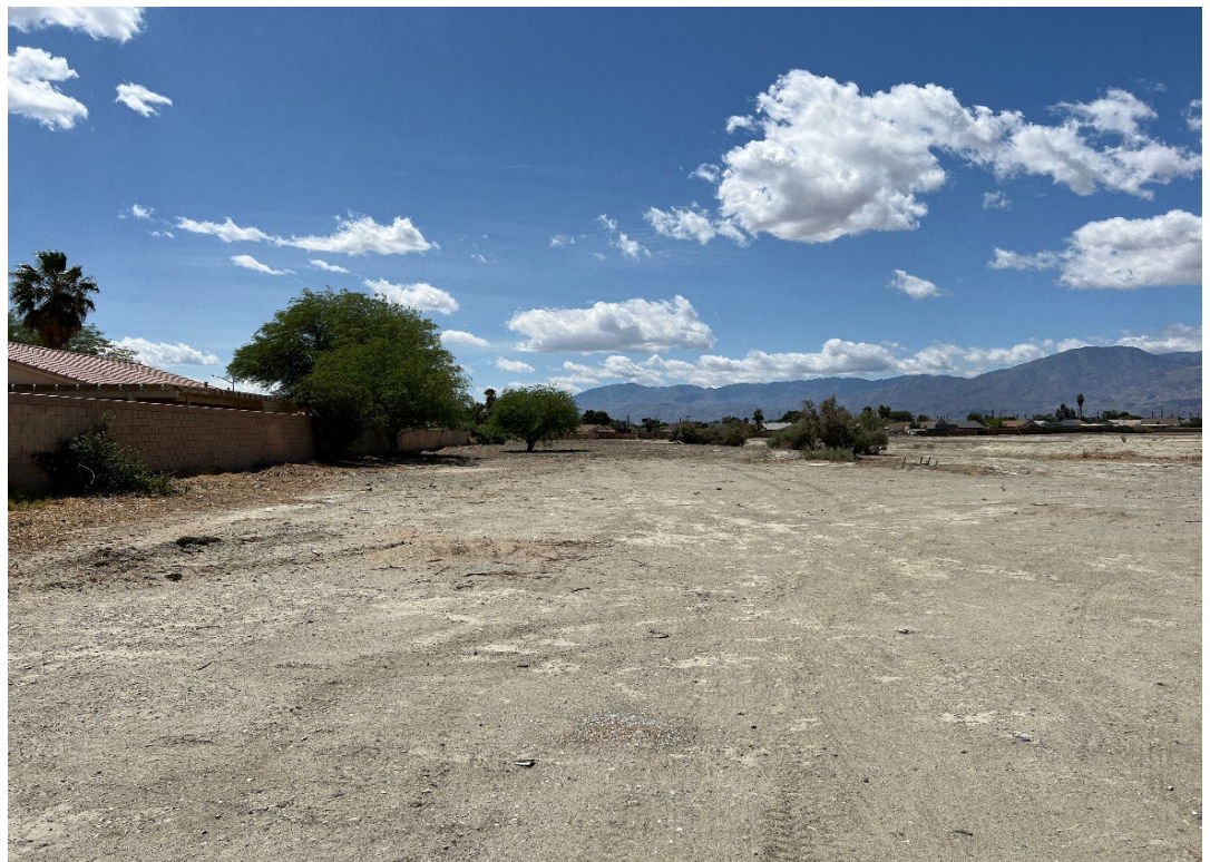
Photo 3 . Looking south along the eastern edge of the project site from the northeast corner.