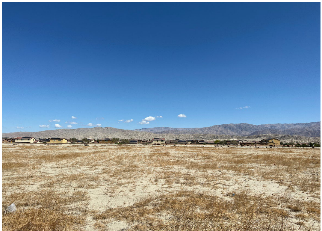
Photo 5. Looking north from the central portion of the project site.