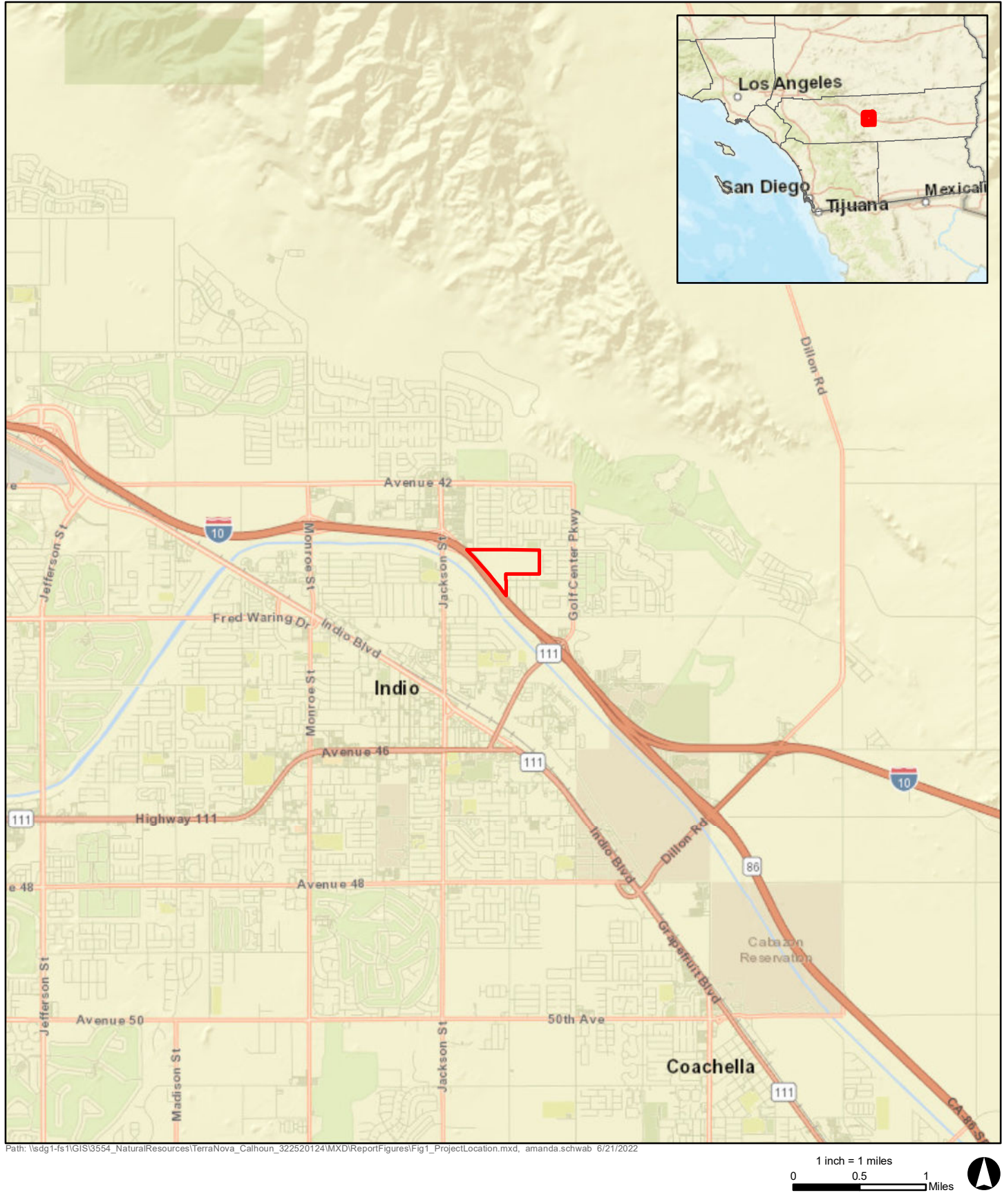
FIGURE 1 Project Location Calhoun Terra Nova Project Indio, Riverside County, CA