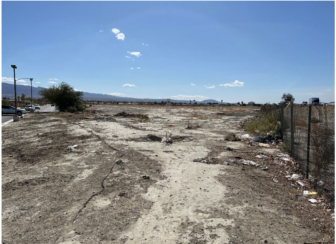
Photo 1. Looking east from the northwest corner of the project site.