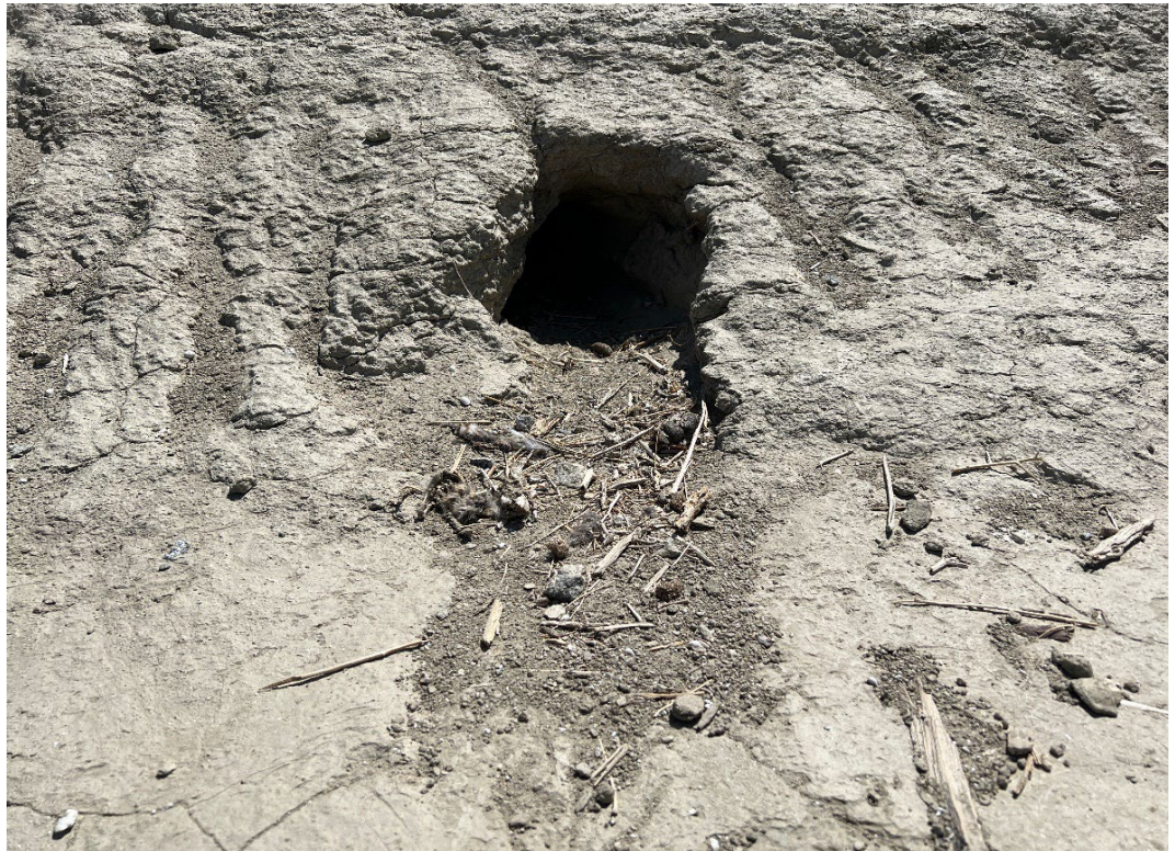
Photo 6 . Looking south at the burrowing owl burrow with sign (whitewash, feathers, pellets, and gathered scat).