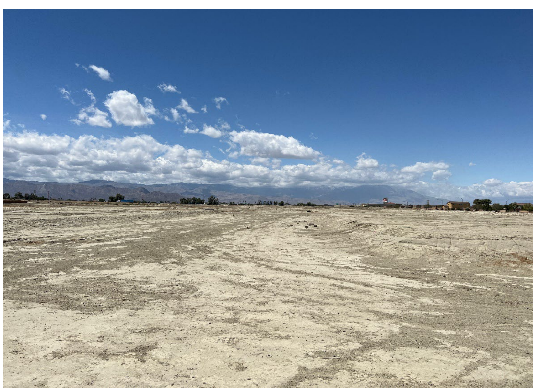
Photo 4 . Looking west at the central portion of the project site from the eastern boundary.