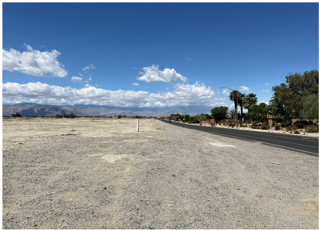
Photo 2 . Looking west along the northern edge of the northeast corner of the project site.