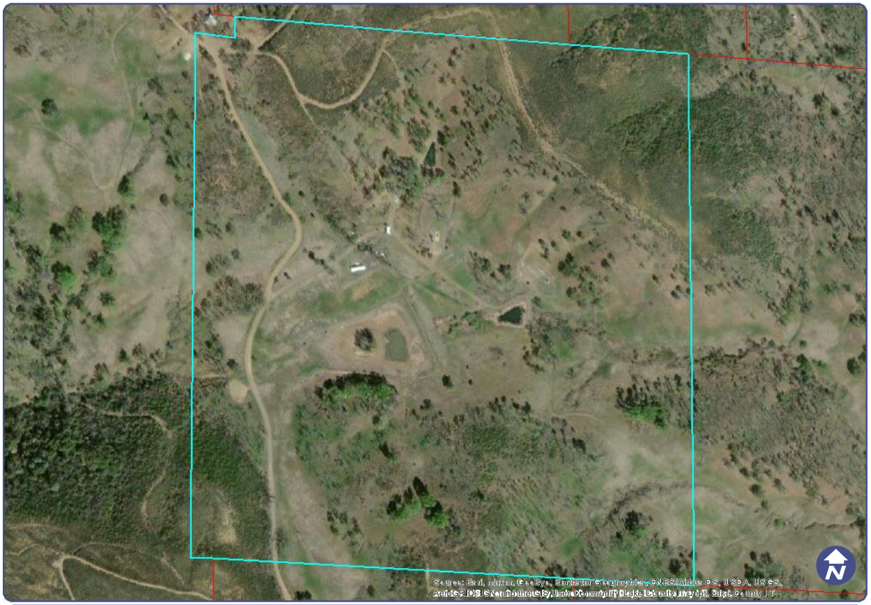
Figure 1. Aerial Image of Project Parcel/Property

The proposed cultivation site will be established in an area that has been used for agricultural purposes. As such, no trees or vegetation will be removed to establish the proposed cultivation operation.