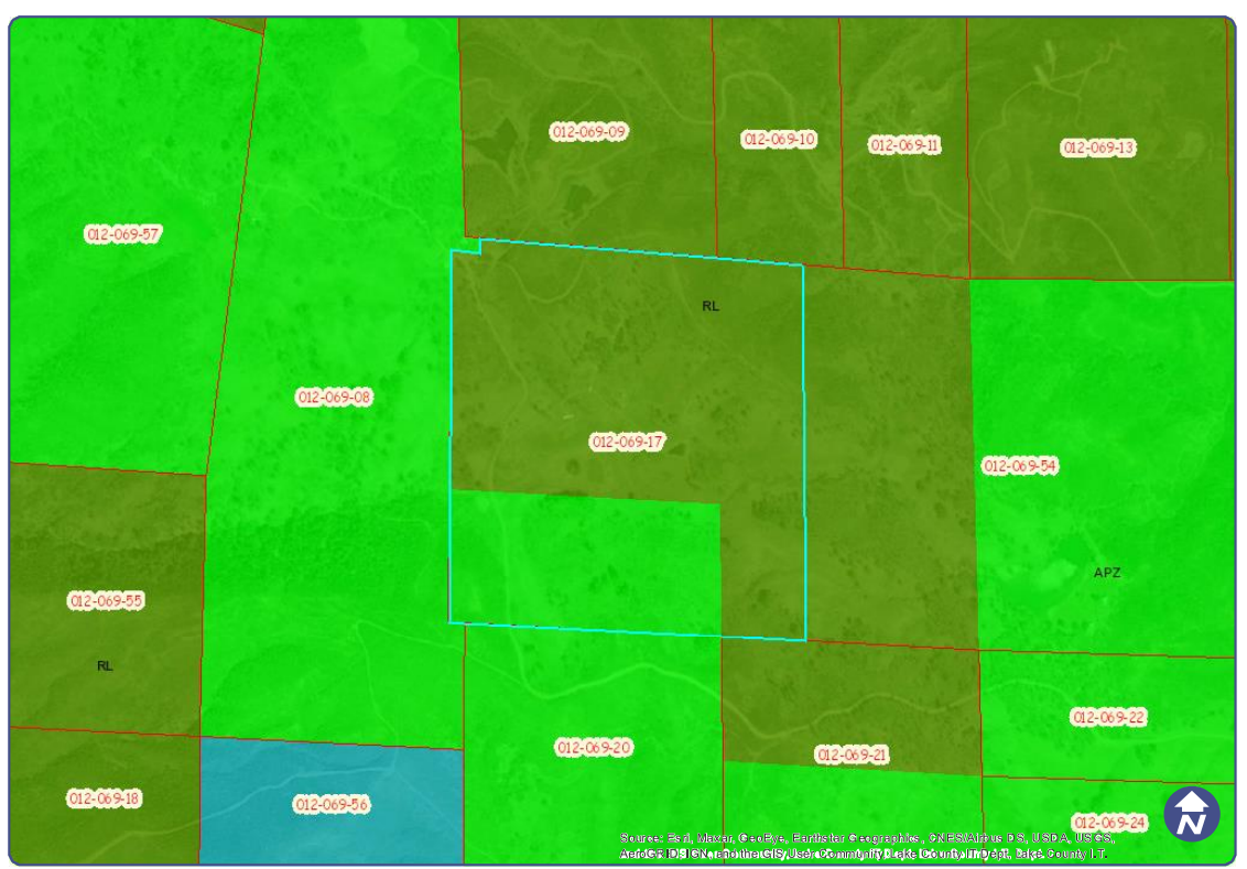
Figure 4: Zoning Project Parcel and Surrounding Properties

All of the surrounding parcels have a Land Use designation of "RL" Rural Lands and "APZ" Agricultural Preserve Zone, and are greater than ten (10) acres in size. These parcels are either undeveloped or developed with residential dwelling/accessory structures and agricultural uses.