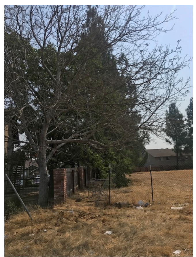
Photo 1, looking east from Stockton Blvd Dead offsite walnut showing on the left