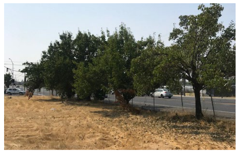
Photo 3, looking south at the ornamental pear trees along Stockton Blvd.