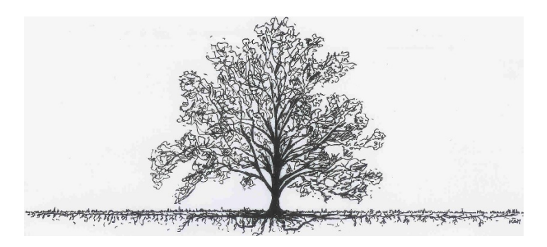
The reality of where roots are generally located

both water and air for survival. Poor canopy development or canopy decline in mature trees after development is often the result of inadequate root space and/or soil compaction.