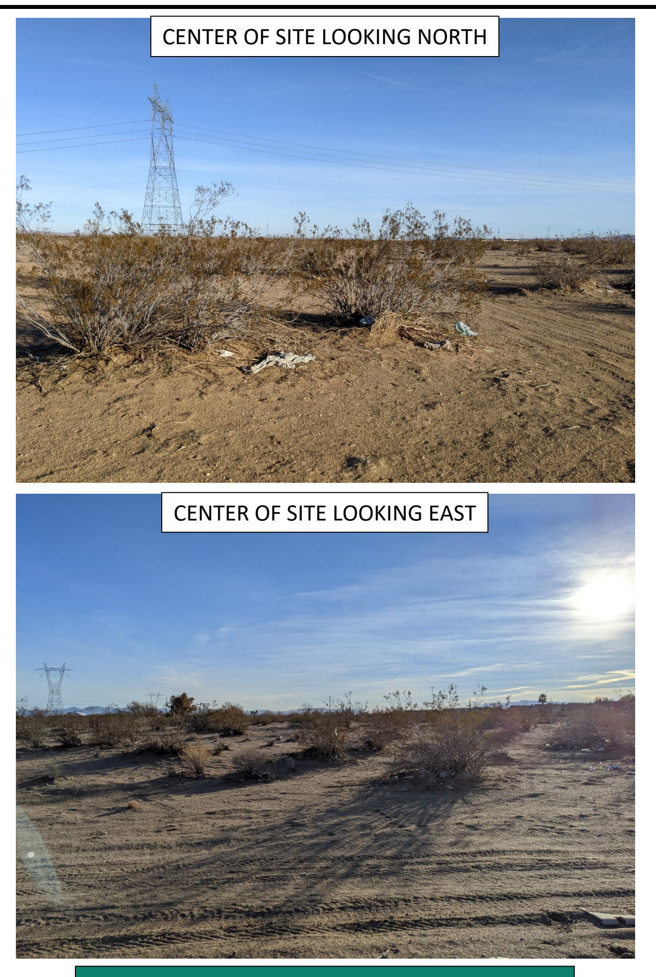
FIGURE 3: PHOTOGRAPHS OF SITE