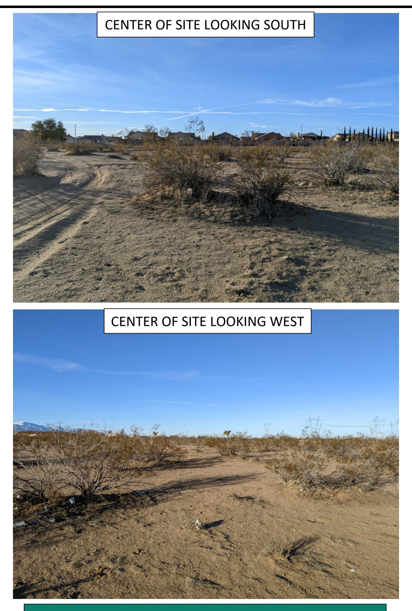
FIGURE 3, cont: PHOTOGRAPHS OF SITE