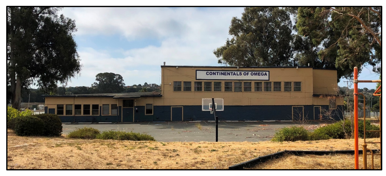
Figure 4. Front of the recreation building, view facing south-southeast.

The recreational building is wood-framed and has a roughly L-shaped plan. Part of the building is two stories tall, and the remainder is single-storied. The roof of the two-story portion of the building is flat and the single-story portion has a very shallow gable. Windows are primarily aluminum, one-over-one, double-hung sashes arranged in long rows at both the lower and upper levels. The building is clad in horizontal, lapped siding and sheets of plywood. Figure 4 shows a picture of the front of the building.