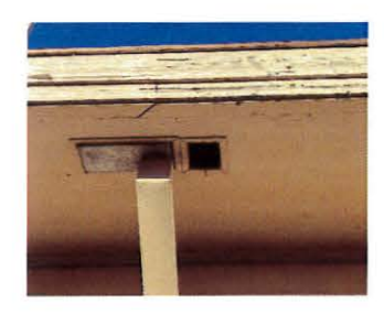
Picture 4. Southeastern side of building to be removed that provides potential roosting habitat for bats. Picture taken at 37°35'28" N 122°21'26" W, facing northwest.