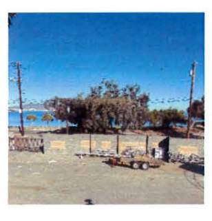
Picture 1. Wall at northwestern portion of facility to be removed for staging area and construction access. Picture taken at 37°35′29″ N 122°21′27″ W, facing north.