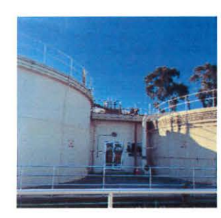
Picture 2. Tanks (left and right) and building to be removed. Picture taken at 37°35′29″ N 122°21′26″ W, facing south.