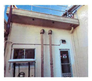
Picture 3. Western side of building to be removed that provides potential roosting habitat for bats. Picture taken at 37°35′29″ N 122°21′27″ W, facing east.