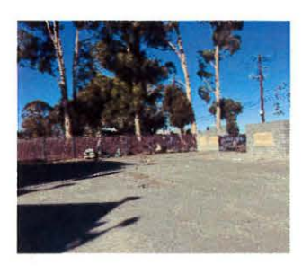
Picture 6. Proposed location of reconstructed tanks and building. Picture taken at 37°35′81″ N 122°21′27″ W, facing northwest.