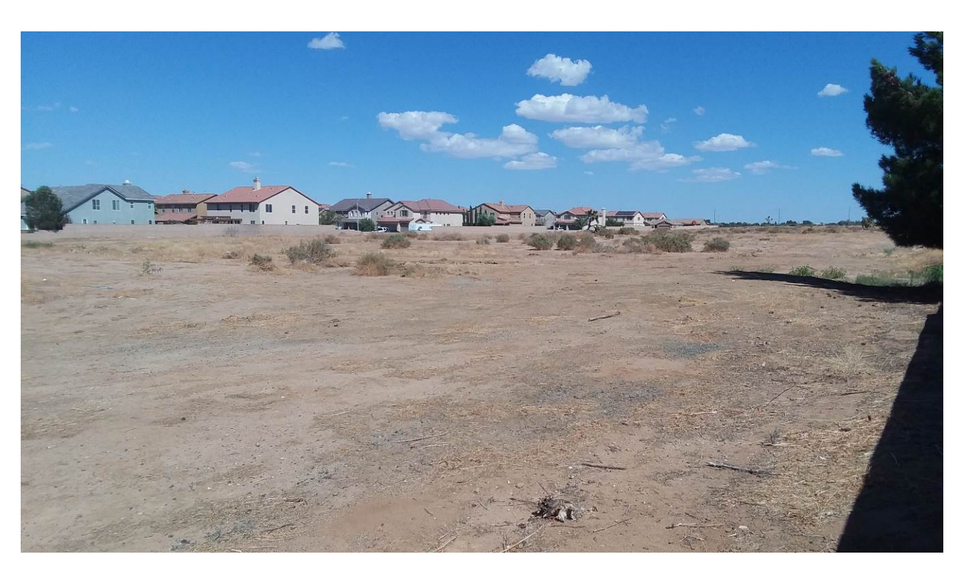
Figure 2 Project Area, View to the Northeast