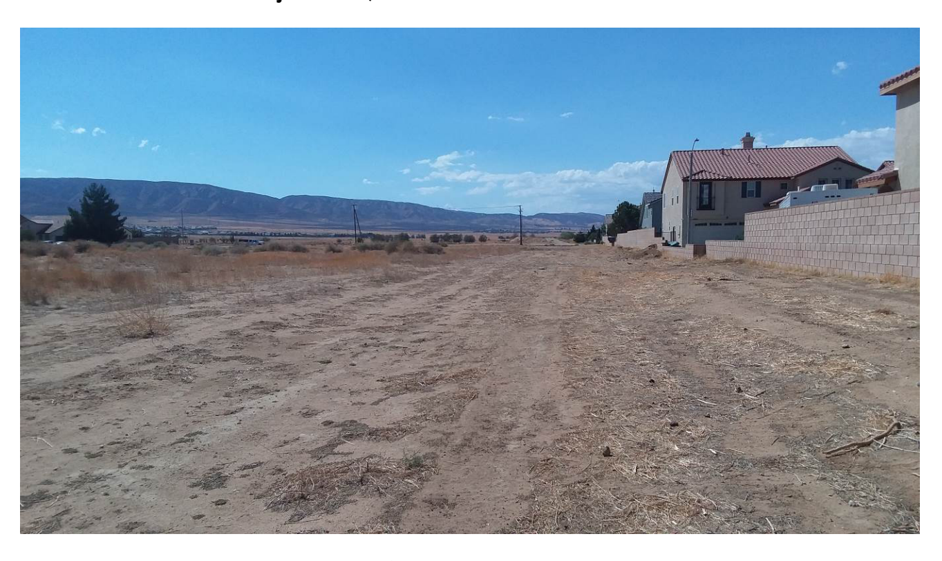
Figure 3 Project Area, View to the West