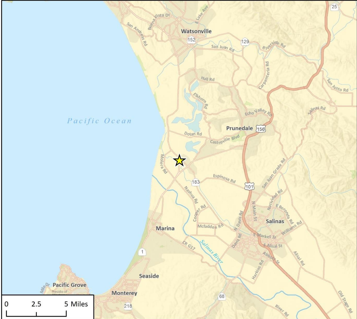
Basemap provided by Esri and its licensors © 2022.