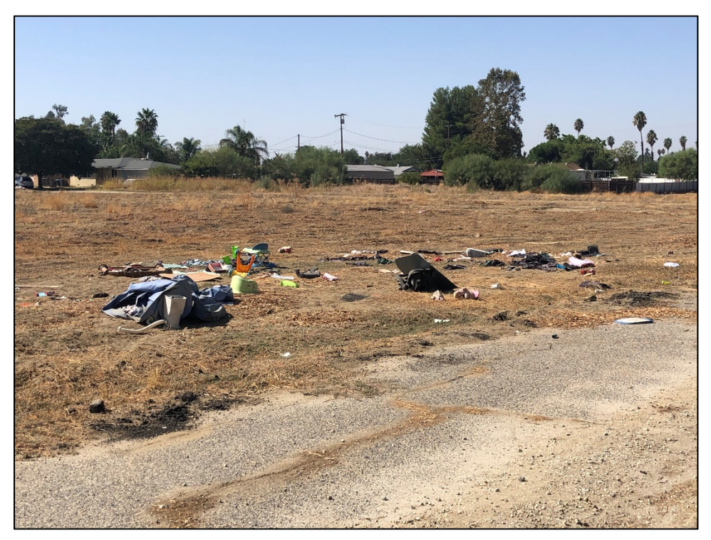
Photo 7: Unauthorized trash dumping and paved road found in central portion of site.