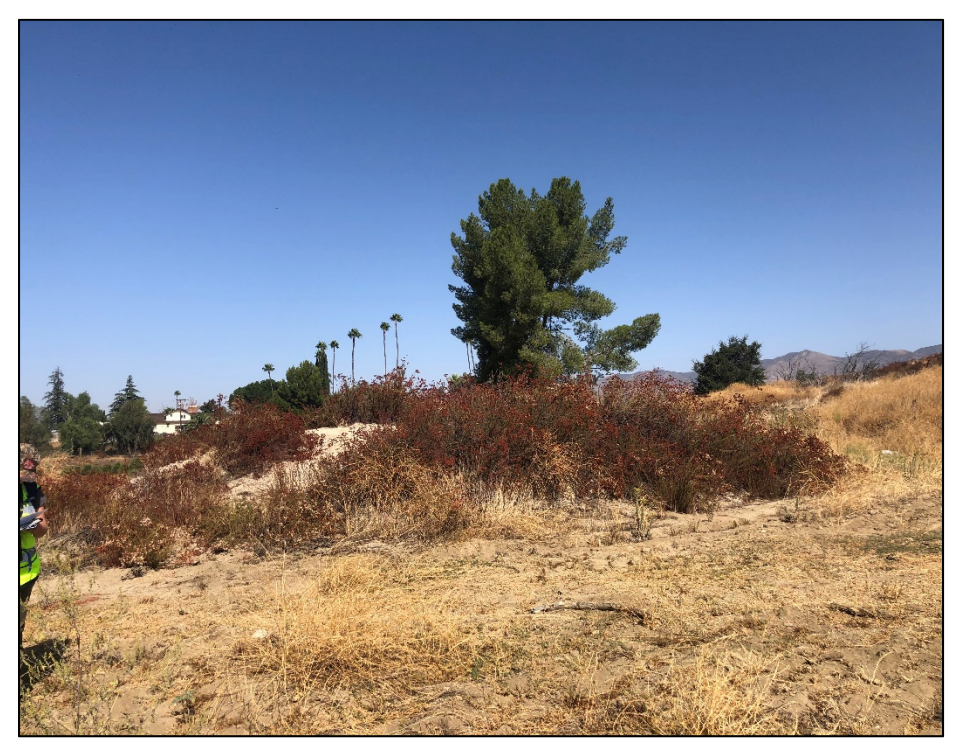
Photo 4: Small stand of disturbed California buckwheat found on eastern portion of project site.