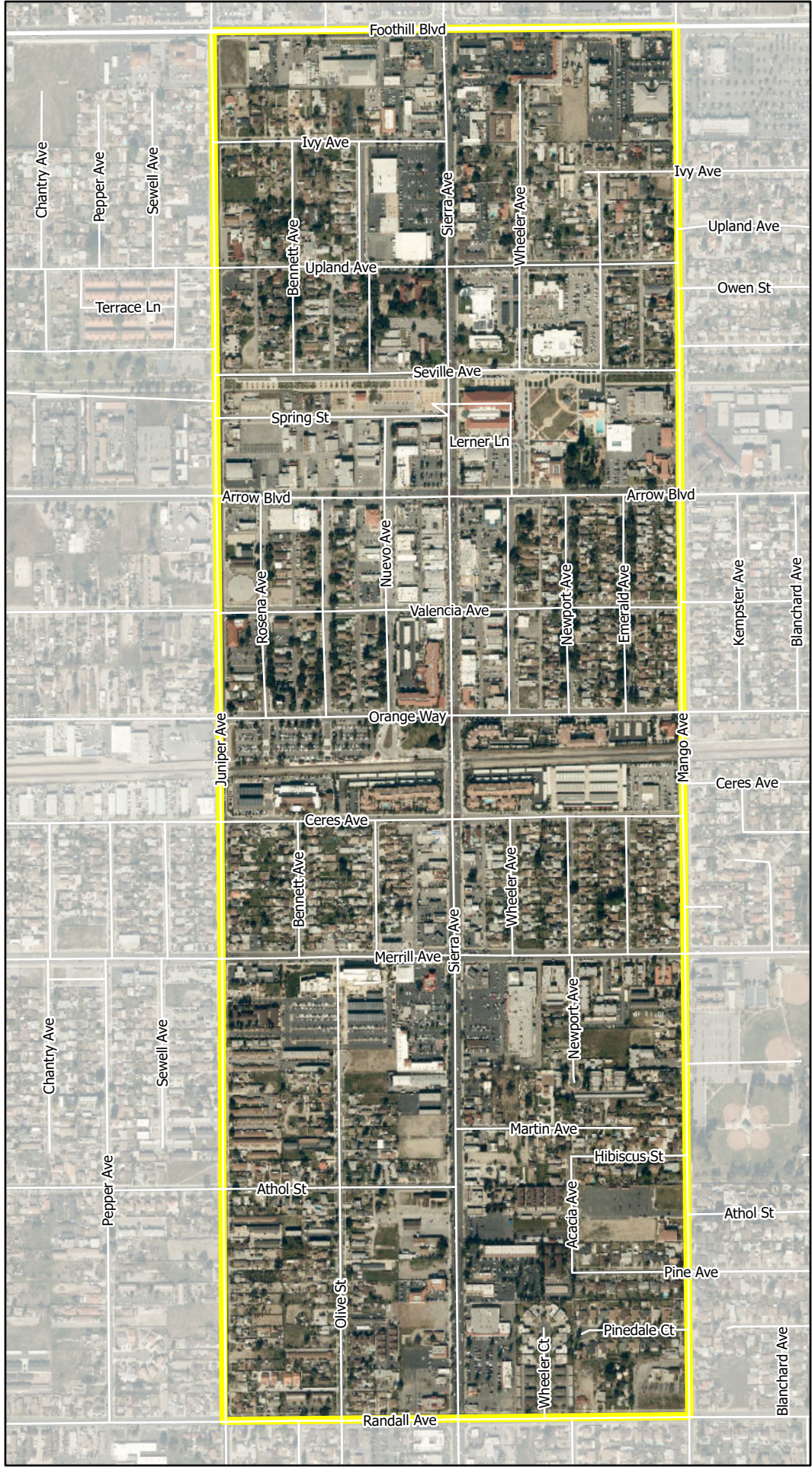
Figure 1. Downtown Core Project Area