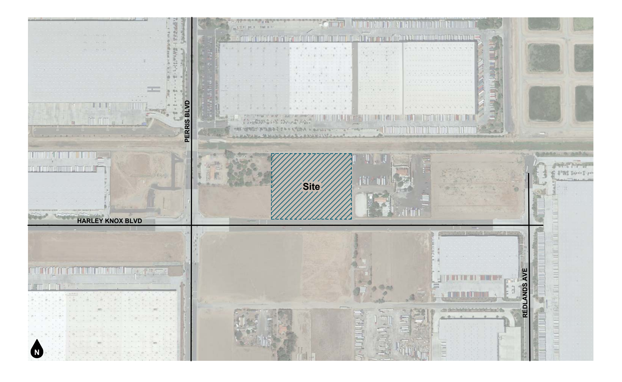
Figure 1 Project Location Map