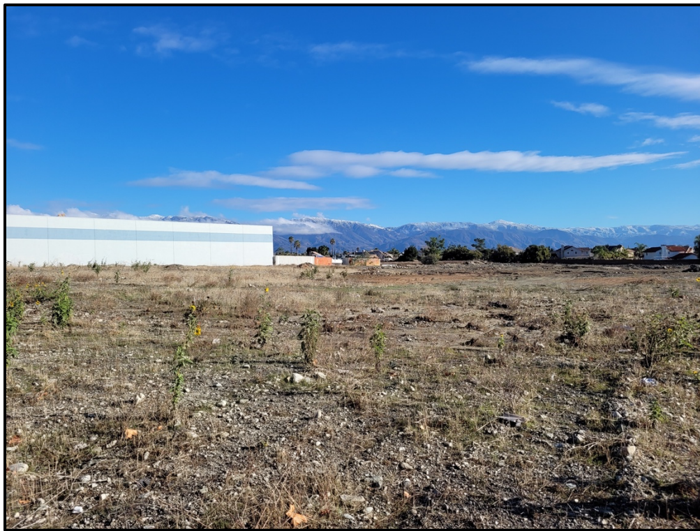
Plate 2: Overview of the project from the southwest corner, facing northeast.