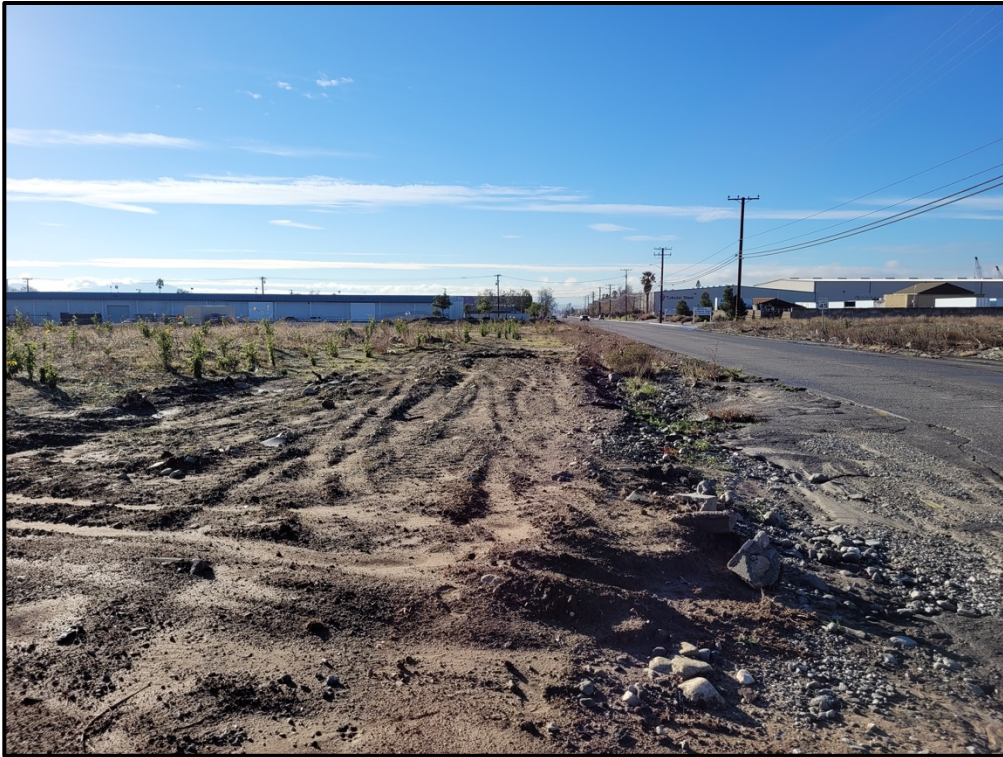
Plate 1: Overview of the project from the northwest corner, facing south.