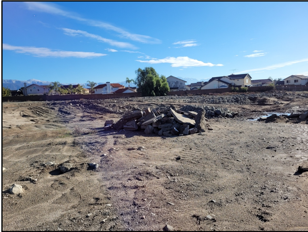
Plate 3: View of dumped concrete/construction debris in the center of the property, facing northeast.