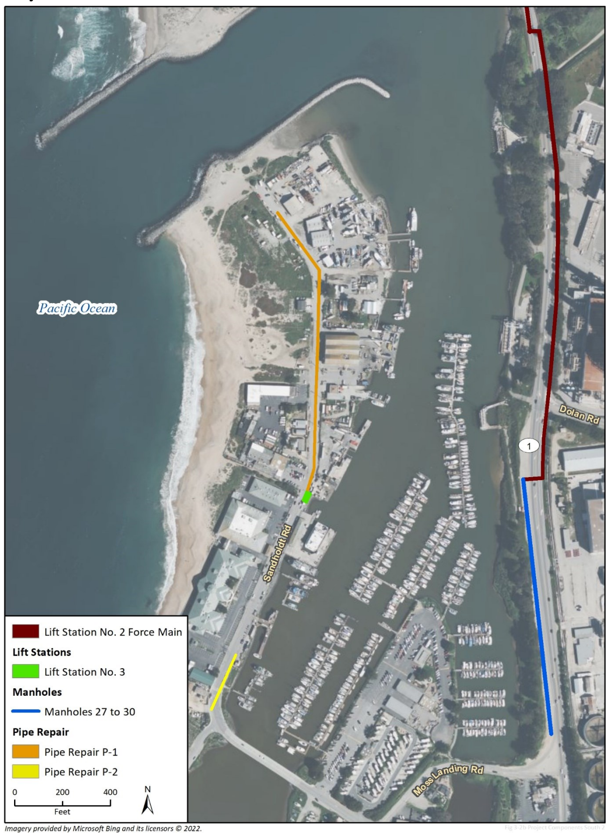
Figure 3 Project Site Location – South-Central Extent