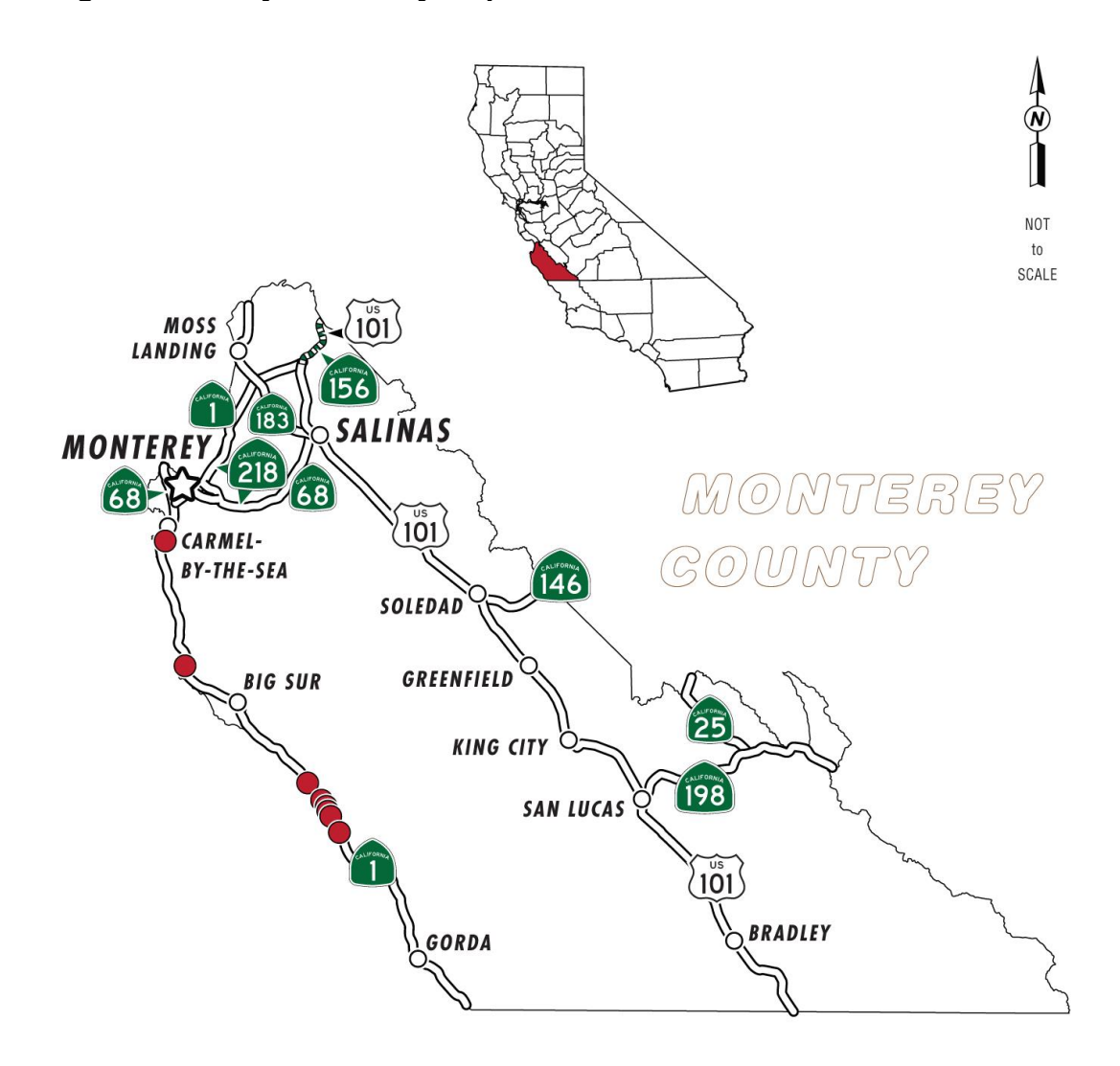
Figure 1-1 Project Vicinity Map