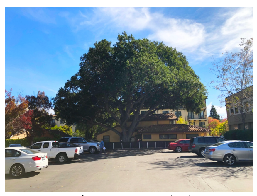
View from 660 University parking lot

There is a majestic, beautiful Coastal Live Oak tree (the "Tree") in the middle of our block. The Tree's trunk is 50 inches in diameter and its limbs stretch out 90 feet in diameter (confirmed by Applicant's arborist). The Tree abuts the back property line of the 660 University project and so its limbs reach out approximately 45 feet over the project's property, and its root structure is probably that large if not much larger. The Tree brings shade and joy to us and everyone else on the block. The Tree is several hundred years old and is deemed a protected Heritage tree by the City of Palo Alto. Applicant's arborist rates the Tree "High" for suitability for preservation.