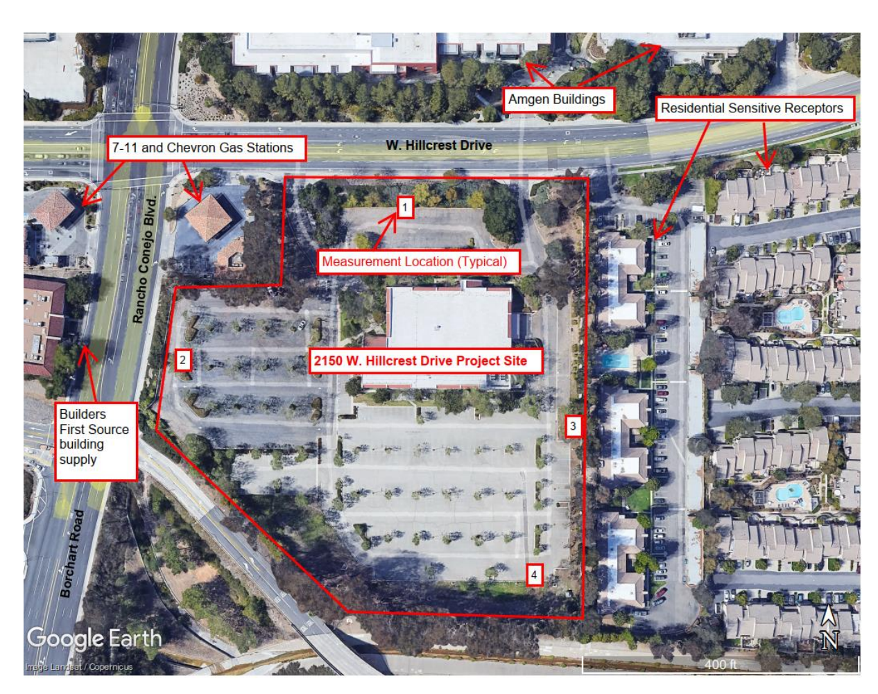
Figure 3. Measurement Locations and Sensitive Receptors Near Latigo Hillcrest Project