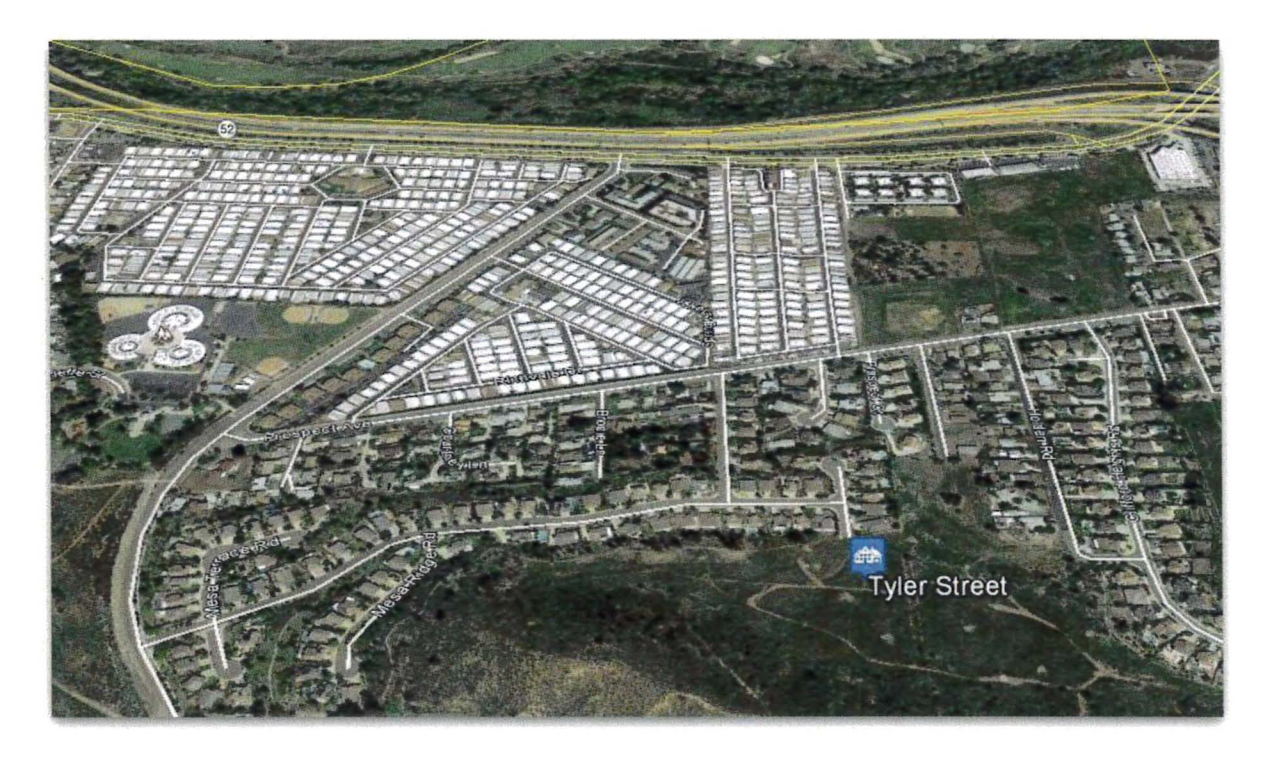
Figure 2 - Location