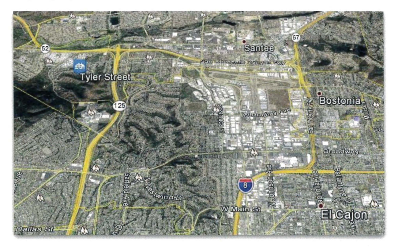
Figure 1 – Vicinity

The Project site consists of currently a vacant lot located in the City of Santee in San Diego County (see Figure 1). More specifically, the Project site is located immediately south of the intersection of Mesa Heights Road and Tyler Street (see Figure 2).