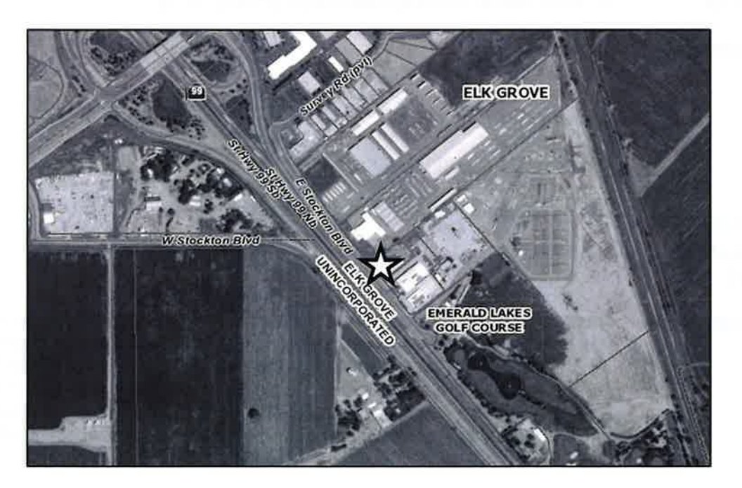
Figure 1 – Vicinity Map