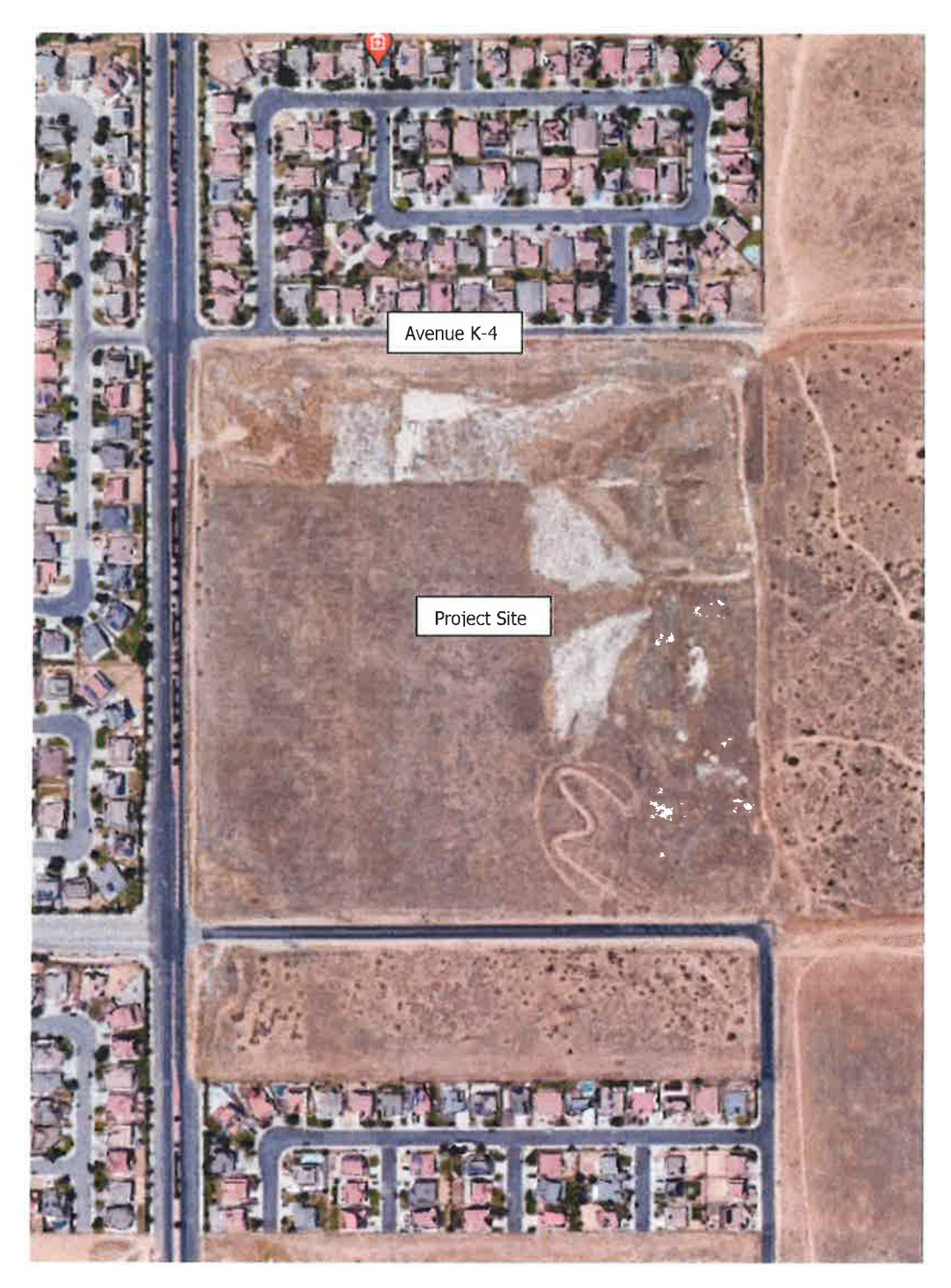
Figure 1, Project Location Map