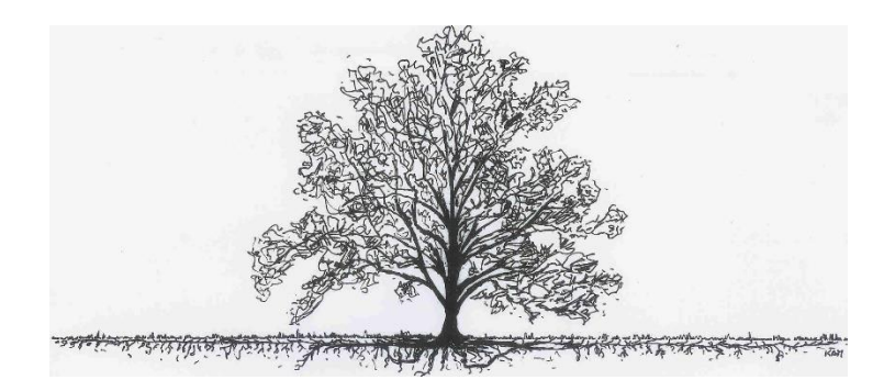
The reality of where roots are generally located Pruning Mature Trees for Risk Reduction and/or Development Clearance

underground resembles the canopy. The correct root structure of a tree is in the drawing below. All plants' roots need both water and air for survival. Poor canopy development or canopy decline in mature trees after development is often the result of inadequate root space and/or soil compaction.