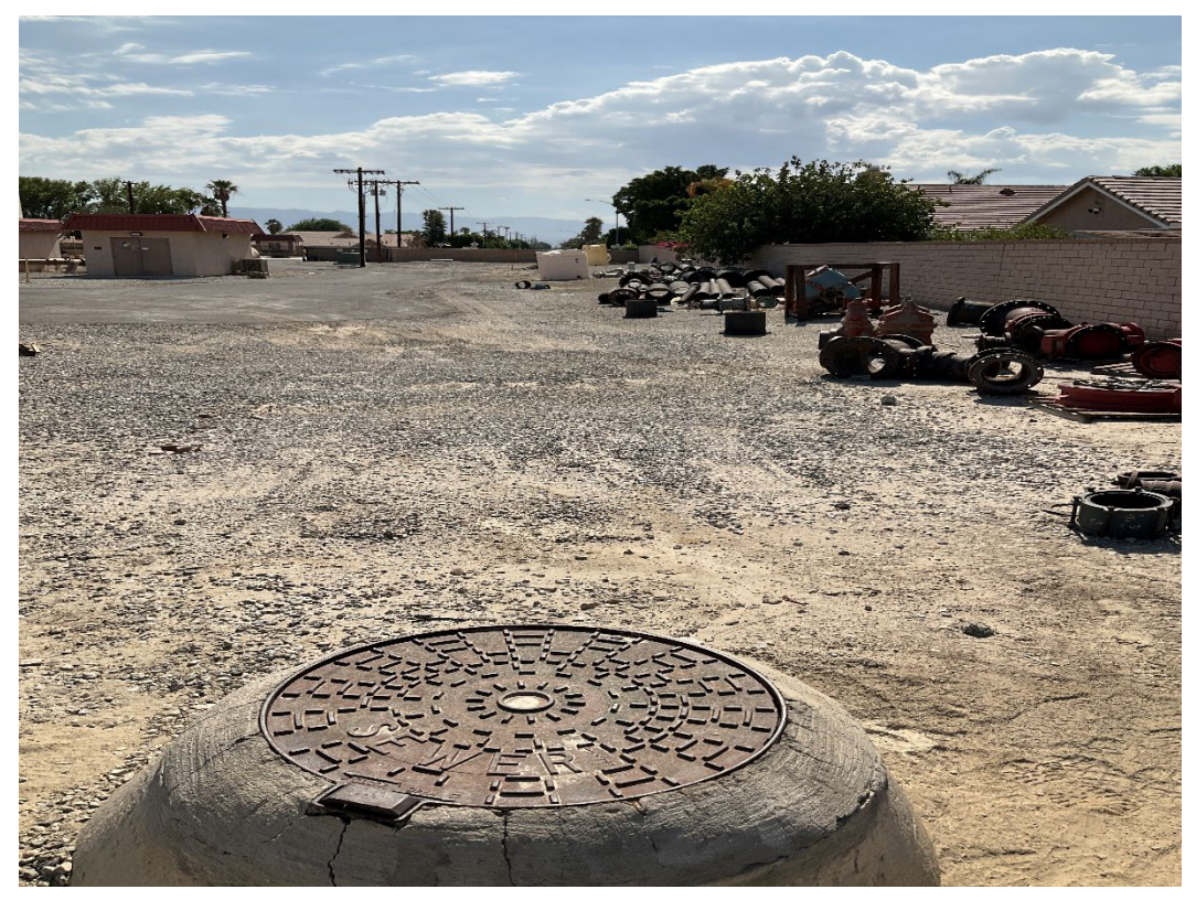
Figure 5-2. Overview of manhole in eastern Project area where tie-in will occur, facing east.