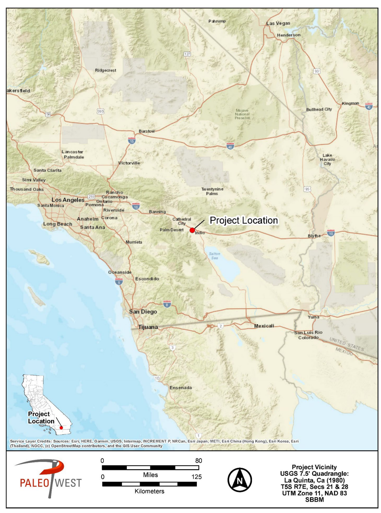
Figure 1-1. Project vicinity map.