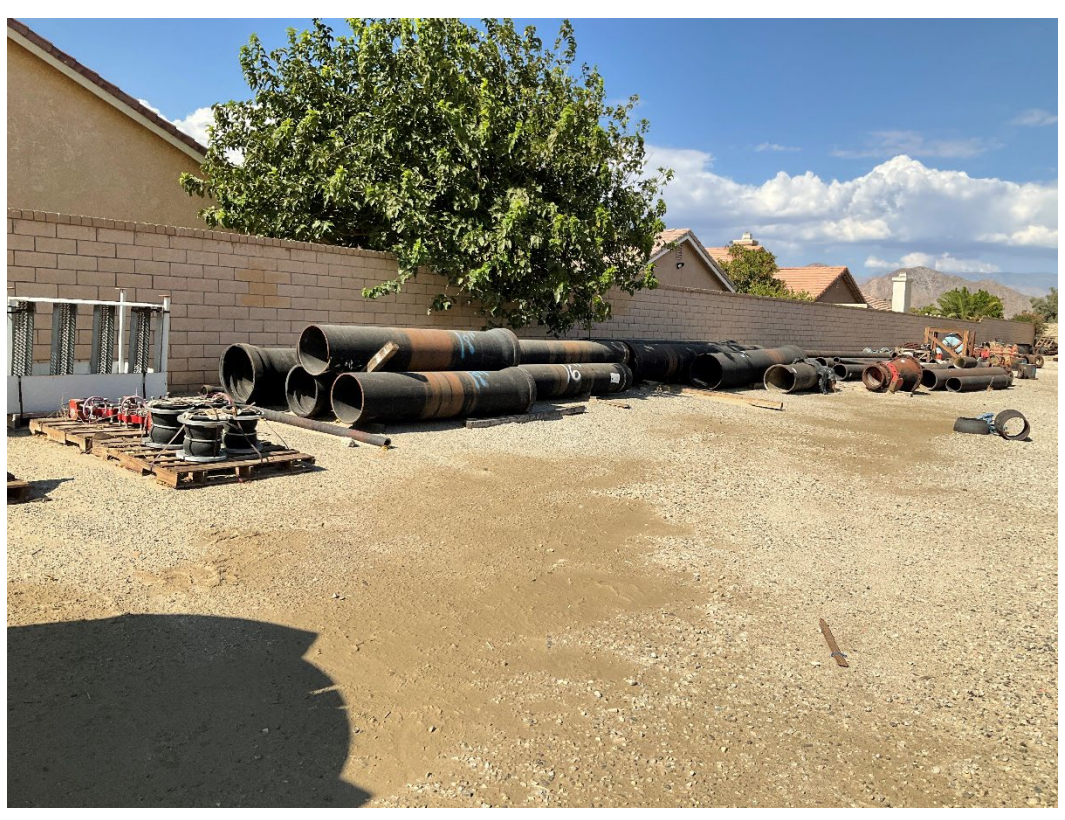
Figure 5-1. Overview of the Project area (east), facing south-southwest.

No prehistoric or historic period (i.e., 45 years or older) archaeological resources were identified on the surface of the Project area during the archaeological survey.