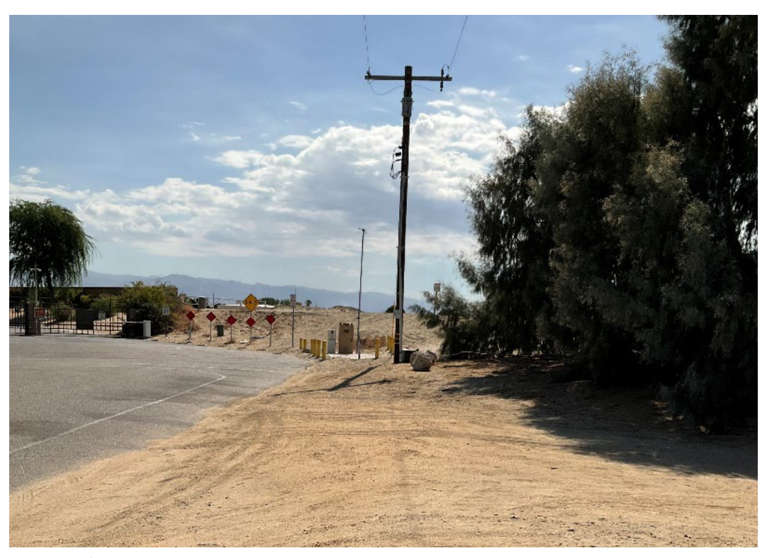
Figure 5-3. Overview of West end of Project area looking toward the channel, facing east.