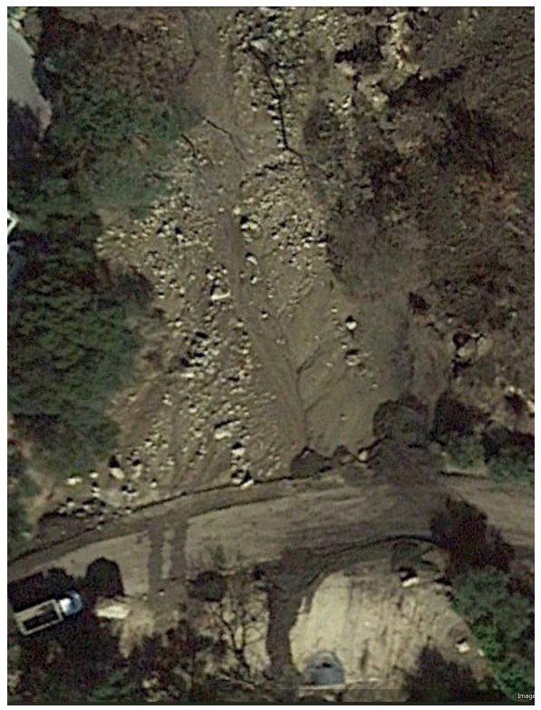
Post-Sediment Flow Site Condition, January 2018