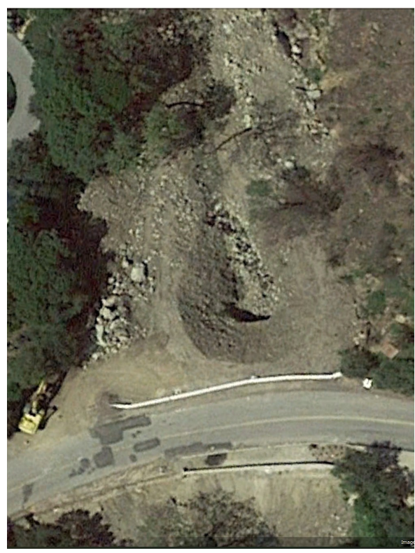
Post-Action: Emergency Sediment Removal, April 2018