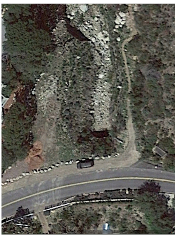
Current Site Condition, March 2022

Source: Google Earth 2022 Imagery Date: December 2017, January 2018, April 2018, March 2022