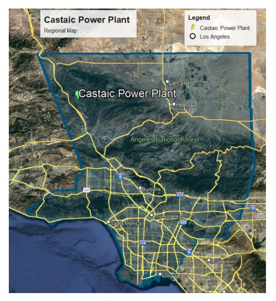
Figure 1. Regional map of Los Angeles County and Castaic Power Plant.