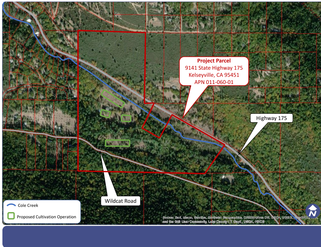
Vicinity Map of Pacific Cann, Inc. Proposed Cannabis Project