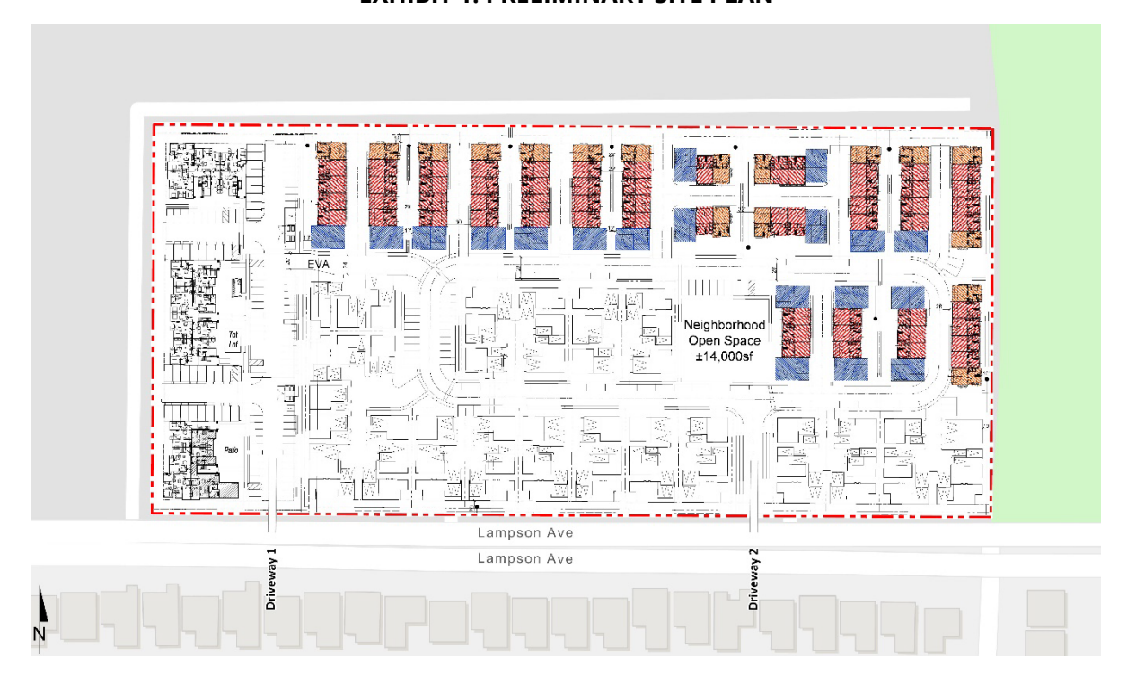
EXHIBIT 1: PRELIMINARY SITE PLAN

The Project consists of the development of 55 single-family detached residential dwelling units (cluster homes), 114 multi-family (low-rise) residential dwelling units, and 77 affordable apartment dwelling units (total of 246 dwelling units). A preliminary site plan for the proposed Project is shown in Exhibit 1.