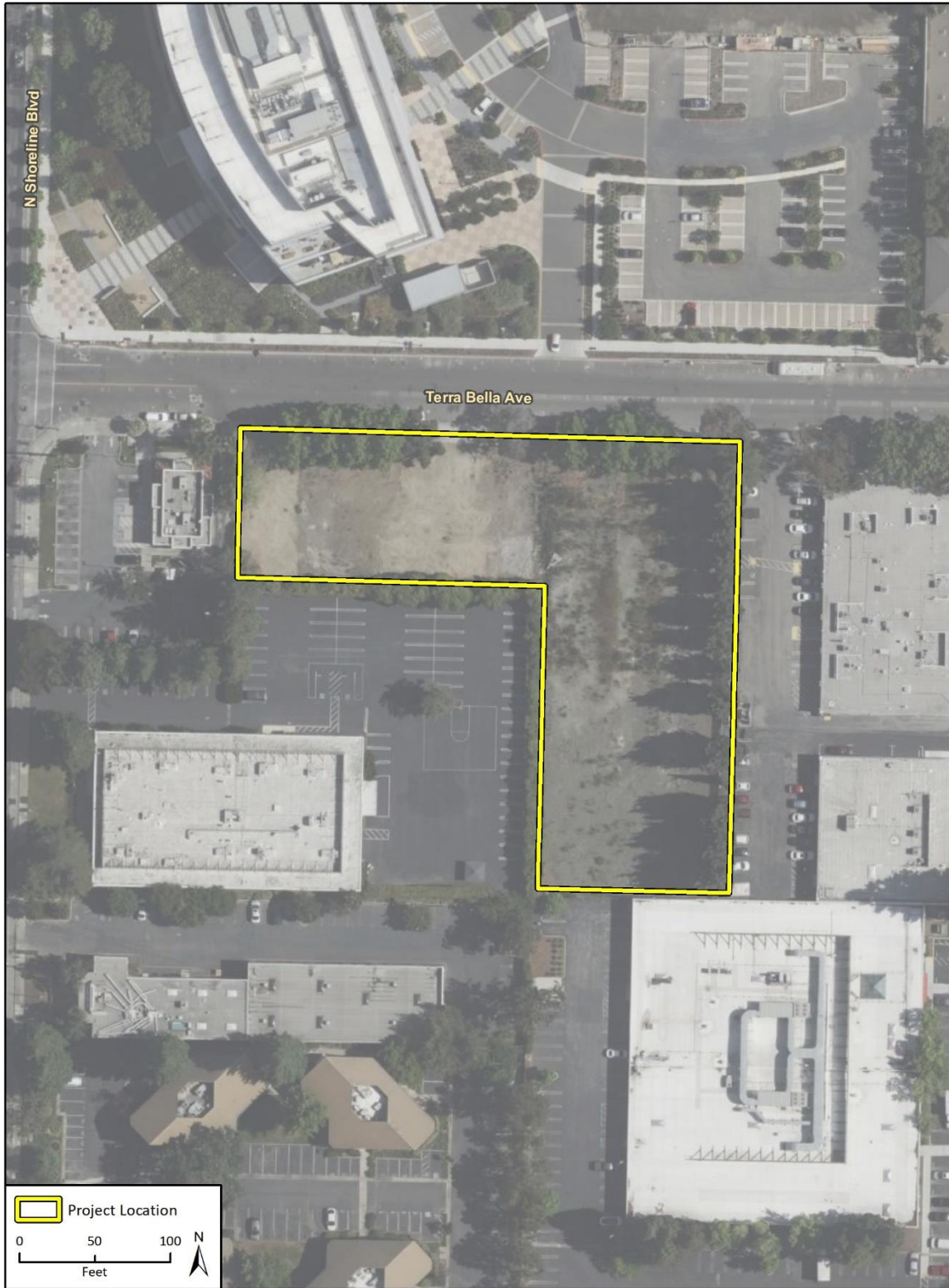
Figure 1 Project Boundary Map