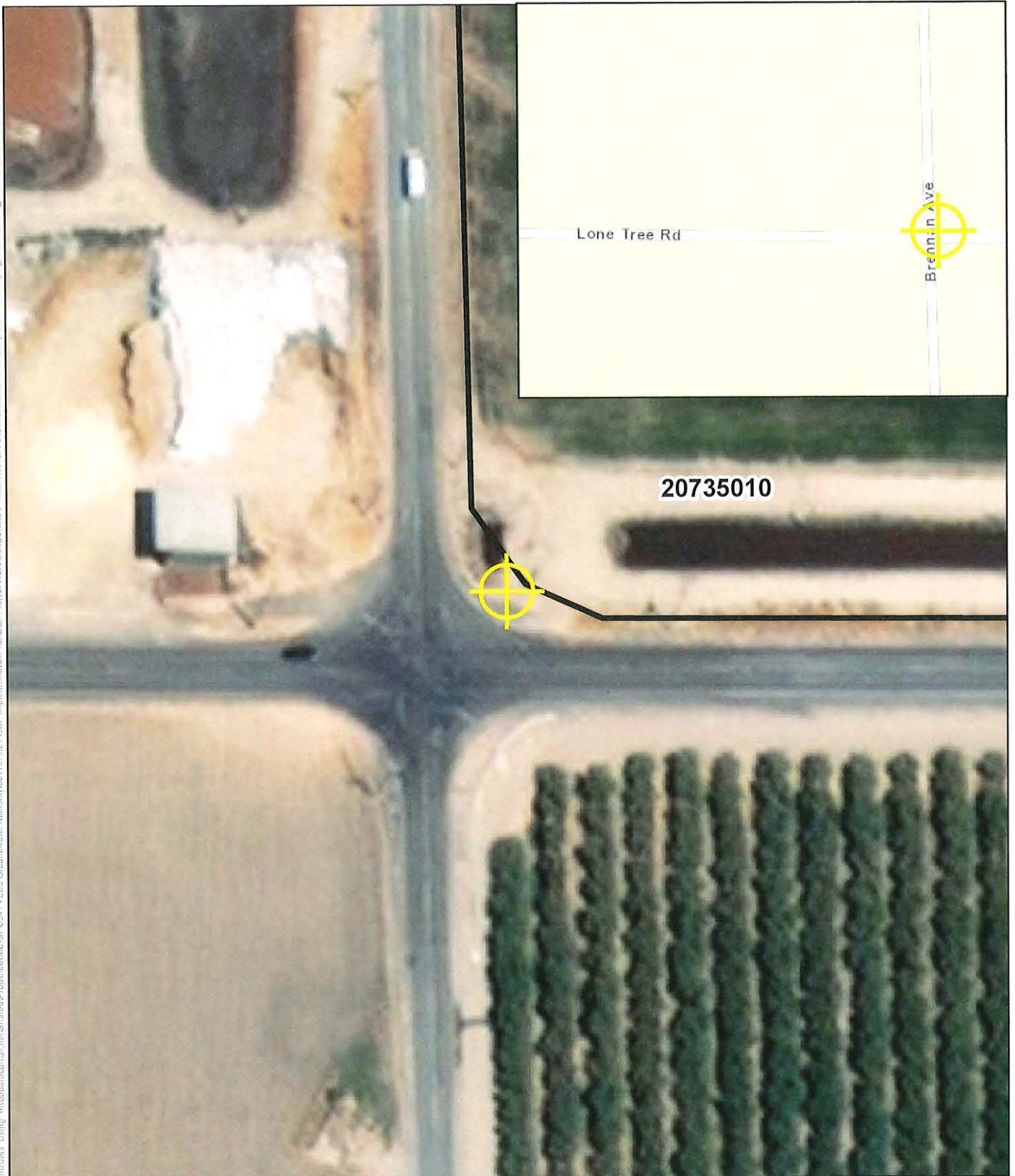
Figure Exported: 2/28/2022 By: gvalenzuela Using: woodwardcurran.net\shared\Projects\GIS\SanJoaquinCounty\Basin\Task2.mxd